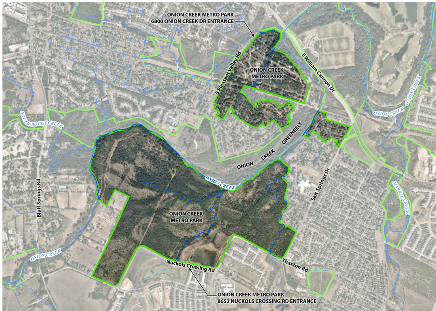
Current Onion Creek Metro Park