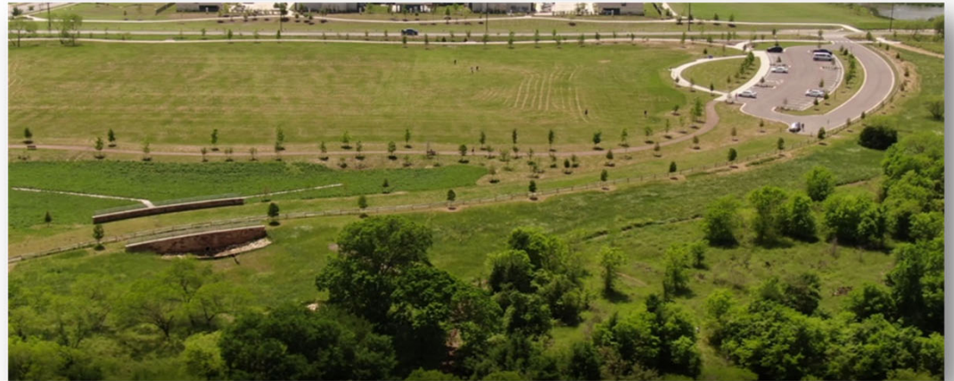
Out of District Base Park Improvements