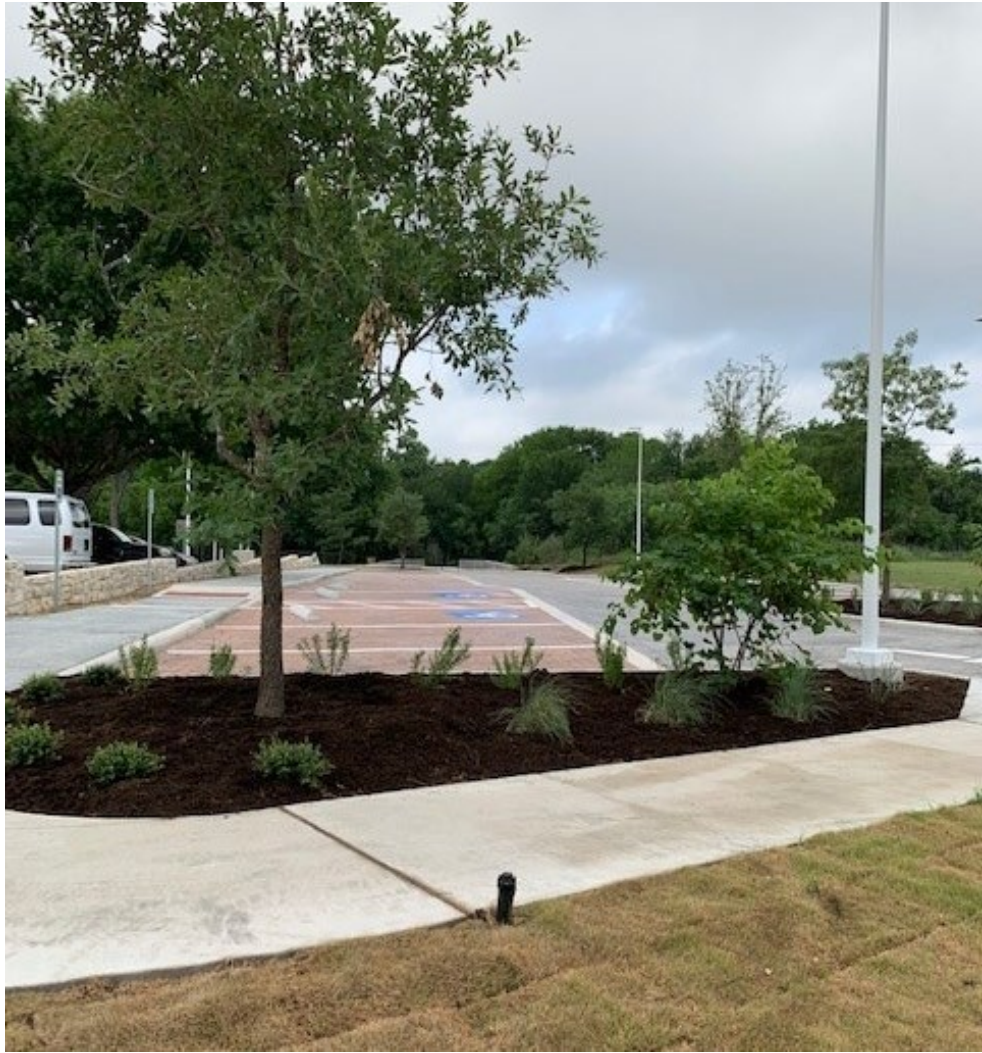
University Hills Parking Lot Expansion