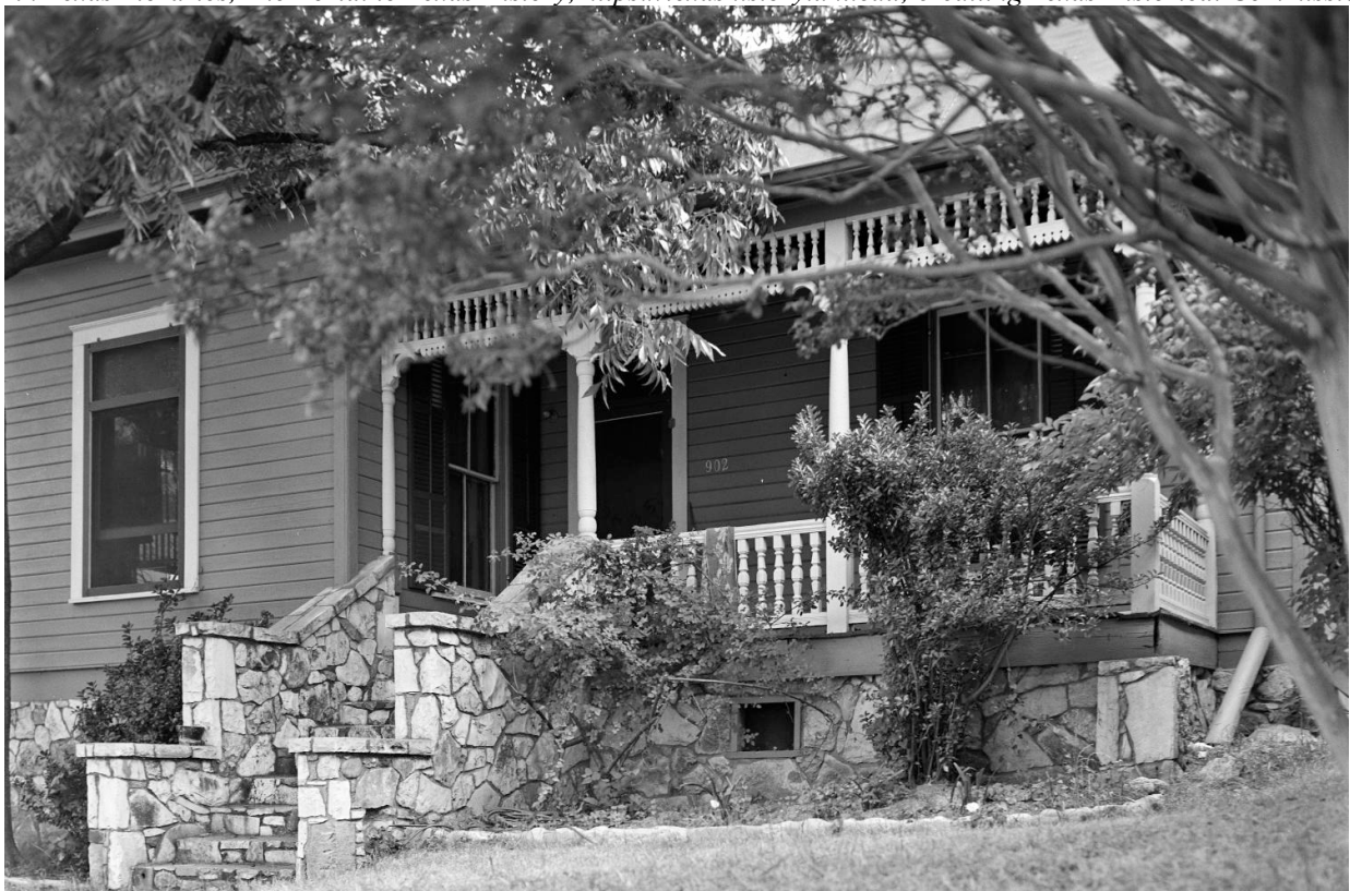
Texas Historical Commission. [Historic Property, Photograph THC_06-0333], photograph, Date Unknown; ( https://texashistory.unt.edu/ark:/67531/metaph672261/m1/1/?q=%22902%20east%207th%22 : accessed April 15, 2022), University of North Texas Libraries, The Portal to Texas History, https://texashistory.unt.edu ; crediting Texas Historical Commission.