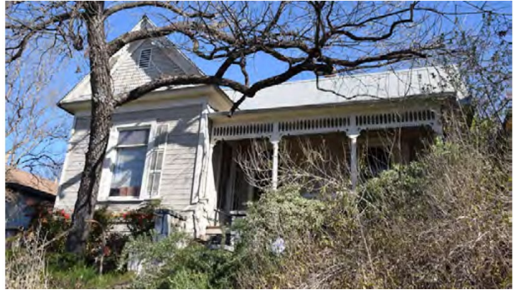
2016 East Austin Historic Resource Survey; HHM, Inc.