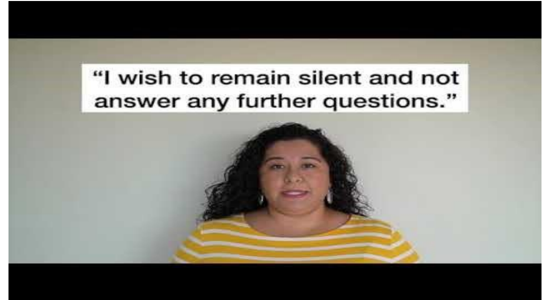
Know Your Rights – The Right to Remain Silent