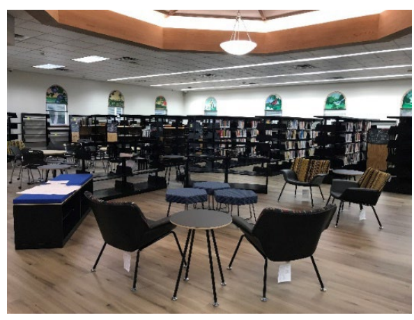
Shelving without End Panels

Although two compressors were recently changed in the building, the building will be warm until all HVAC repairs are complete. The HVAC work has been prioritized and is tracking to wrap up the first week of July 2022.