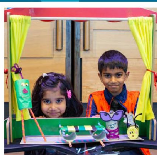
Director's Report June 2022