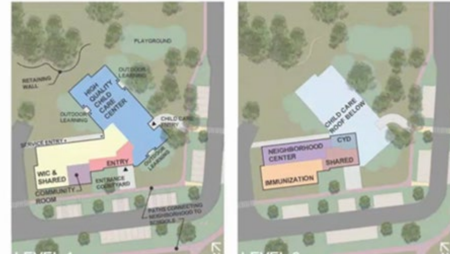
Site Vicinity Plan