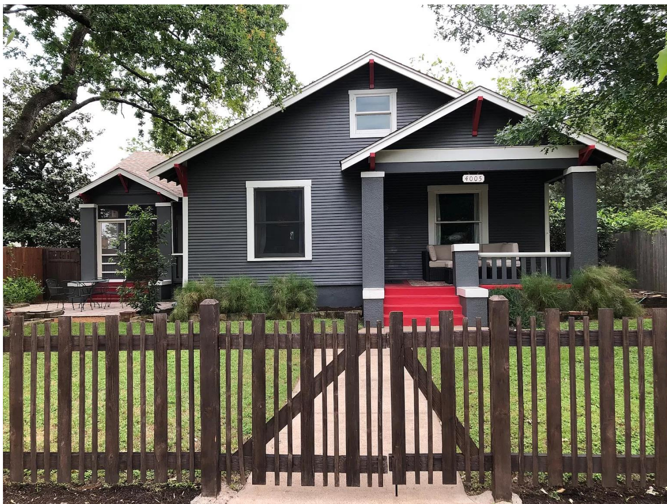
3909 Avenue G (Zillow, 2022)