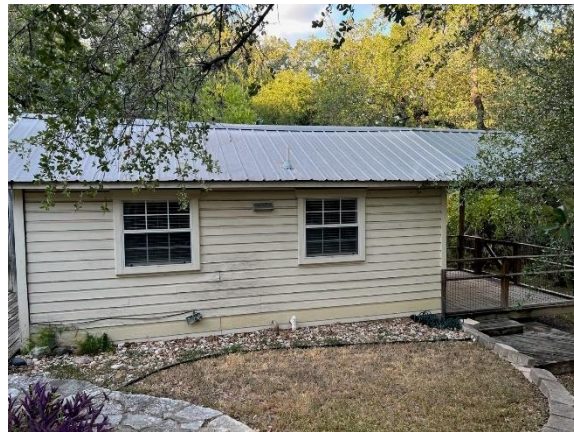
Rear accessory structure photos, application