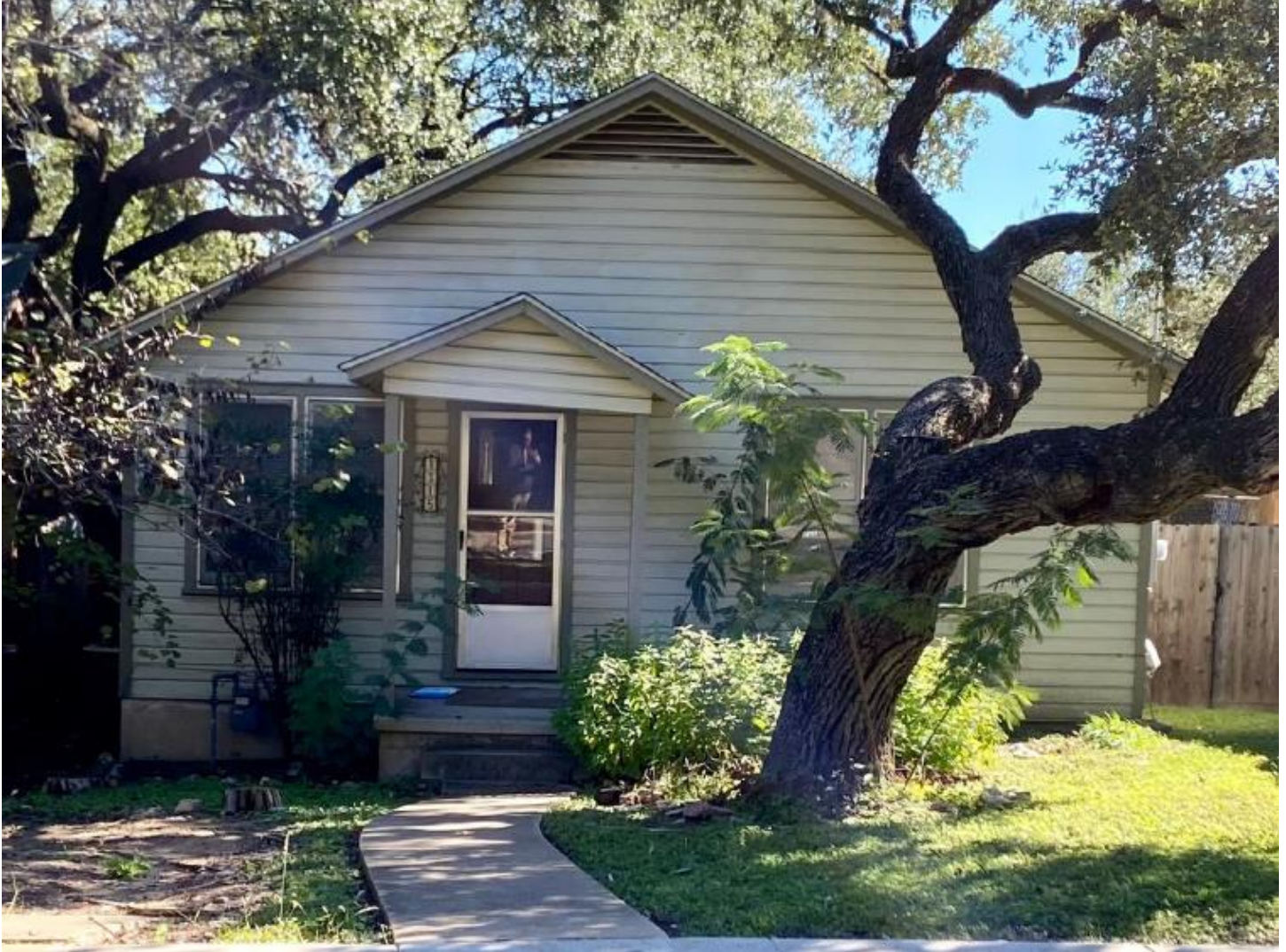
Demolition permit application, 2022