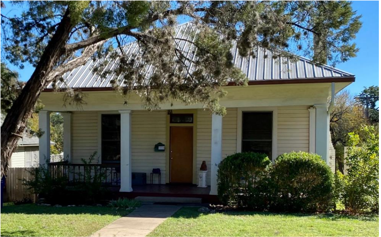
Demolition permit application, 2022