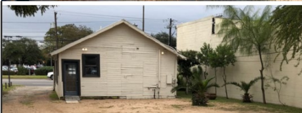
Demolition application, 2022