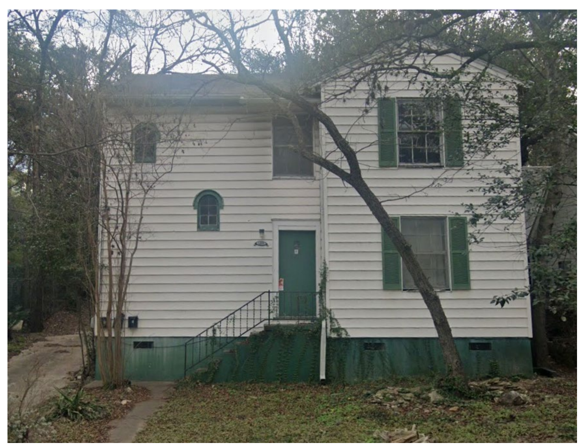
Google Street View, 2022