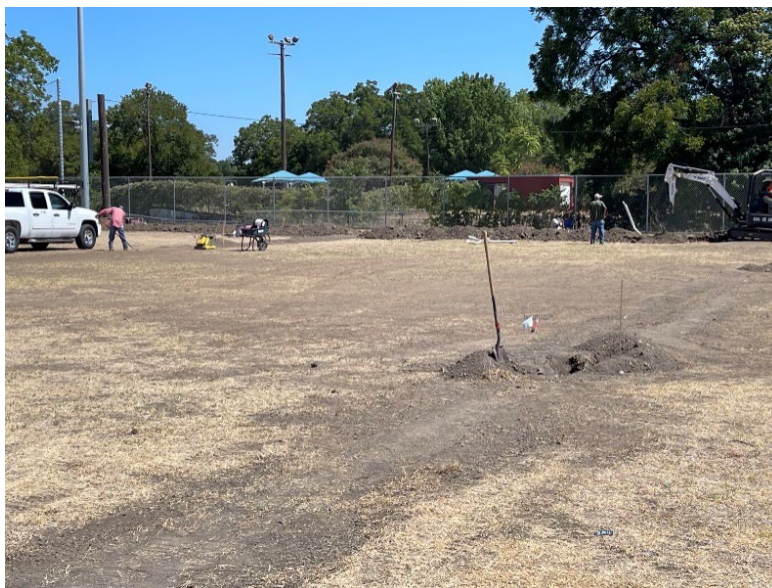
Irrigation construction at Parque Zaragoza ballfield