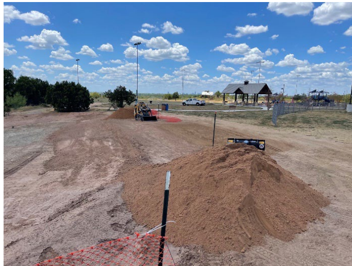
Construction of Turner Roberts Recreation Center's RC Track

Turner Roberts Recreation Center: Turner Roberts Recreation Center recently began construction of a new Radio-Controlled Car Track. Participants in the program will learn components of Science, Technology, Engineering and Math (S.T.E.M) as they build and race their own cars around the outdoor RC track. District 2