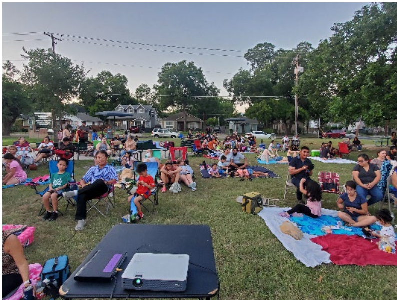
Mendez recreation center hosts its annual summer movie in the park series

Mendez Recreation Center: Mendez Recreation Center closed its summer Movie in the Park Series after six weeks of Friday night movies resented to the community. August 12, 2022 included Nickelodeon's Good Burger to cap off a summer series of movie watching under the summer sky. Special thanks to Sendero Healthcare for proving movie goers with food and snacks throughout the summer series event. Average attendance throughout the summer was 50. District 1