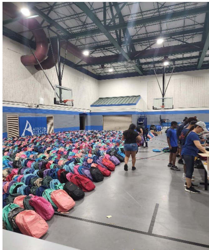
4,000 stuffed backpacks