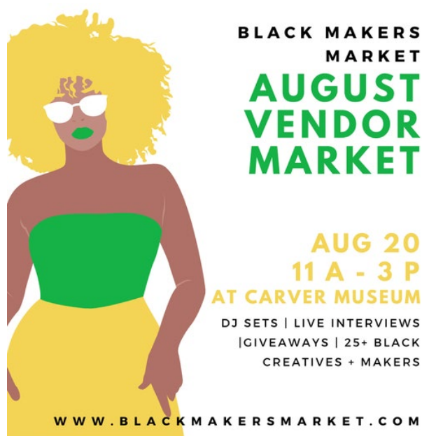
Black Makers Market August Vendor Market" Flyer Featuring a Woman in Sunglasses

The Black Maker's Market: The Black Makers Market is back at the Carver! Dozens of local artisans, and creatives serve up their finest arts and crafts for you. The event was hosted Saturday, August 20, 2022, from 11 am-3 pm - with DJ Sets, live interviews, and giveaways. Estimated attendance is 500. Black Makers Market . District 1