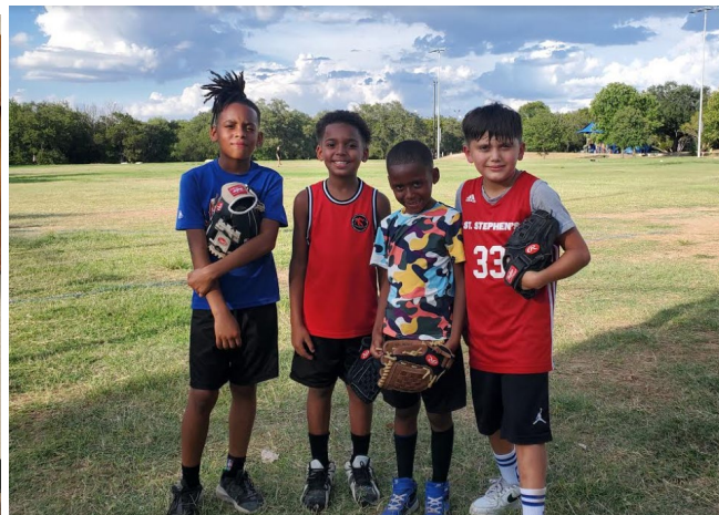
Youth Sandlot Baseball kids with their Gloves