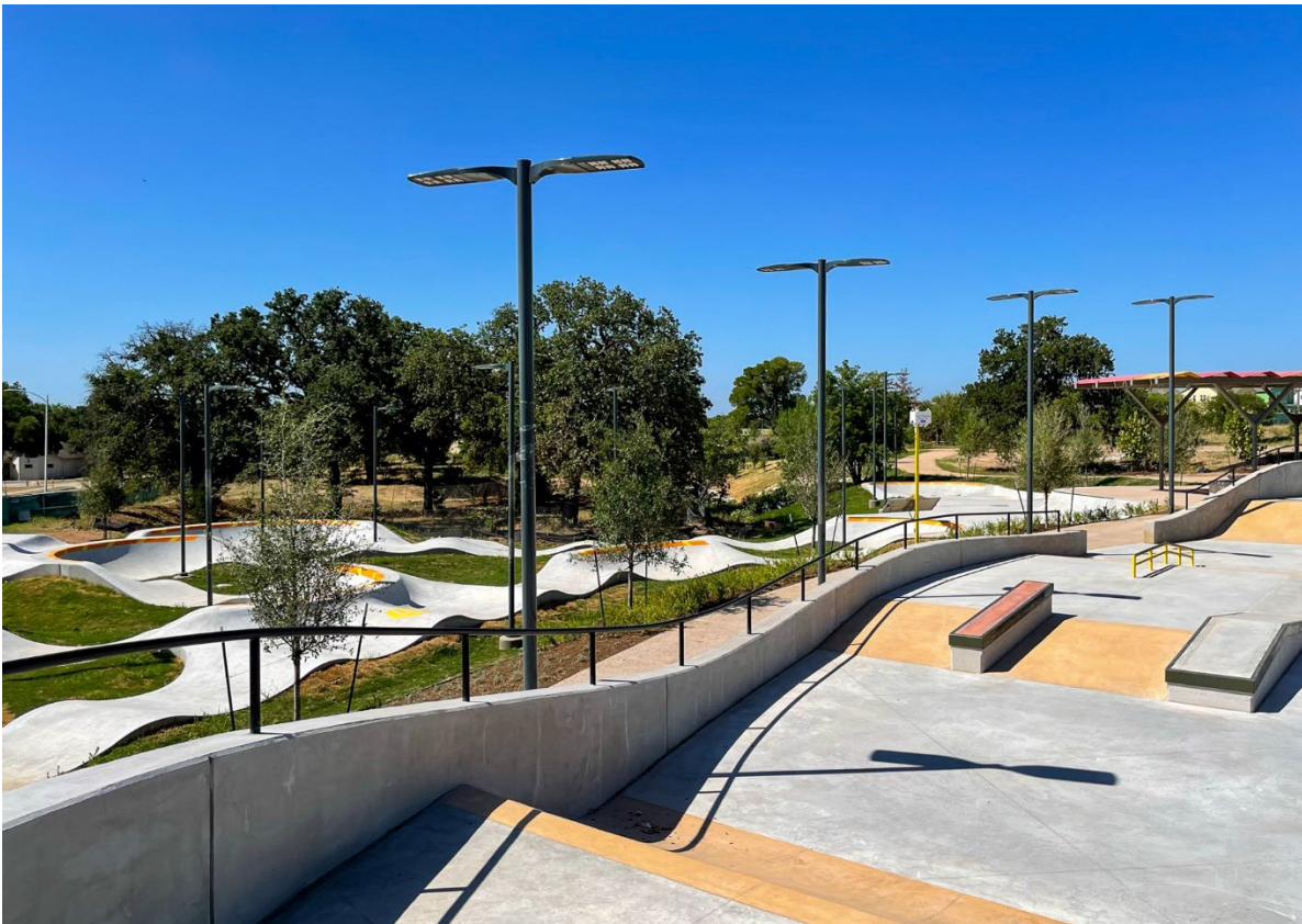
Mueller Skate park opened on August 11.

Mueller Skatepark: The Mueller neighborhood’s latest amenity, the skate park and cycle pump track, opened on Thursday, August 11, 2022. It is the newest phase of the Southeast Greenway. The new facility is accessible from Manor Road and Zach Scott Street near the upcoming Austin ISD Northeast Austin Middle School. The park has features designed for skateboarding, inline skating, and riding BMX bikes and includes a colorful shade canopy, restrooms, and a water fountain. The skatepark was funded and developed by Catellus, master developer for the Mueller neighborhood, and was transferred to the Department as dedicated parkland at the completion of the project. District 1