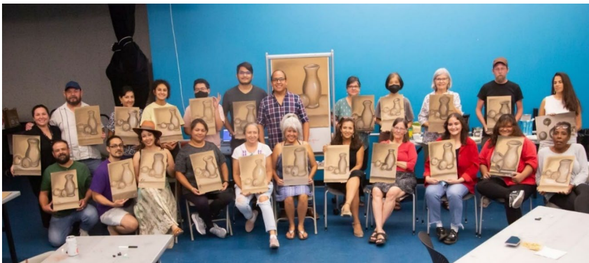
Participants at One of the Taller Abierto Free Art Classes at the ESB-MACC

Brush Square Museums O. Henry Playhouse Video Series: A long-lost television anthology series "The O. Henry Playhouse" has been lovingly restored and is now available to view again through ClassicFlix, www.classicflix.com . Museum staff at the O. Henry have been sharing highlights from these restored videos that are based on O. Henry Stories. District 9