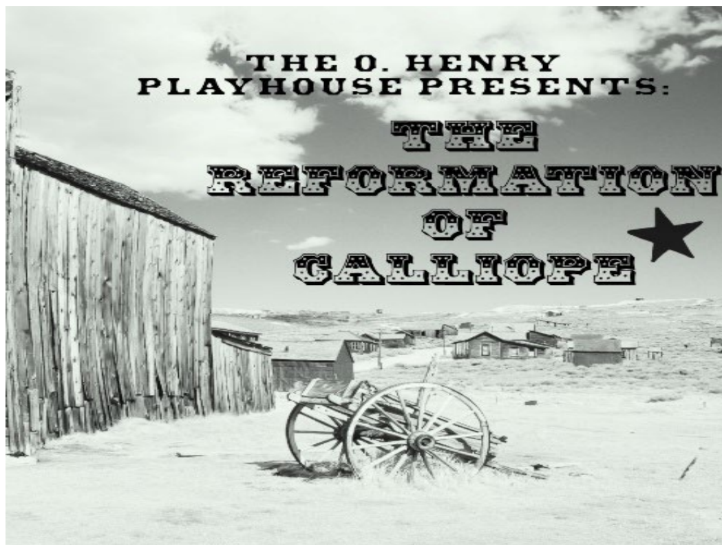
The Reformation of Calliope Presented by the O. Henry Playhouse

Brush Square Museums O. Henry Playhouse Video Series: A long-lost television anthology series "The O. Henry Playhouse" has been lovingly restored and is now available to view again through ClassicFlix, www.classicflix.com . Museum staff at the O. Henry have been sharing highlights from these restored videos that are based on O. Henry Stories. District 9