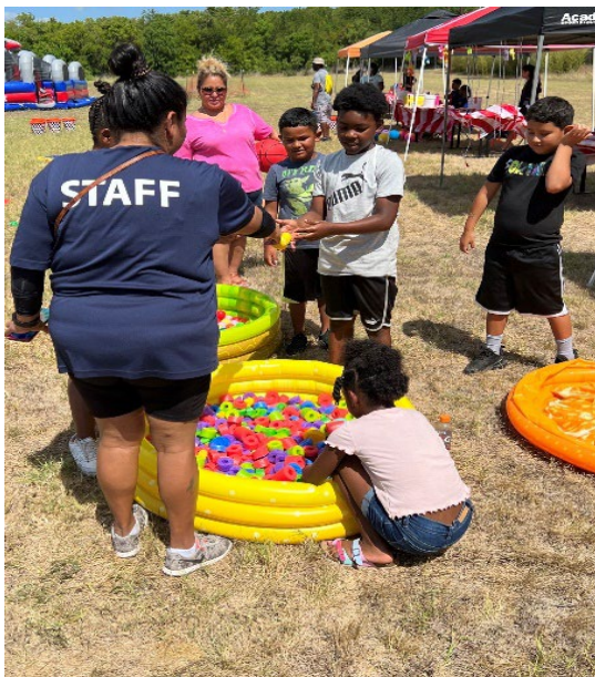
Youth enjoying carnival games

George Morales Dove Springs Recreation Center: The George Morales Dove Springs Recreation Center held the first ever “Dove Park Madness” event on July 23, 2022, from 10 am-2 pm. This event was done in coordination with the previously mentioned Council office town hall meeting. Approximately 105 visitors attended this event and enjoyed a fun day of inflatable obstacle courses, carnival games and prizes. District 2