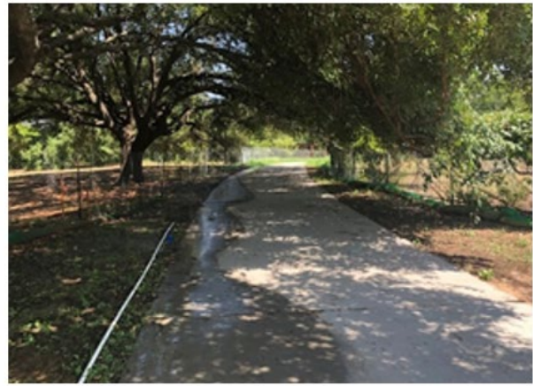
Left: Overlook area Right: trail entry from pedestrian lagoon bridge on the new Holly Lake Front Trail

Pharr Tennis Center Renovation: The renovation of the Burnett “Blondie” Pharr Tennis Center started construction on August 15, 2022. The project will refurbish the courts, add energy-efficient sports lighting, replace fencing, windscreens, and court amenities, and provide accessible parking, security lighting, shade structures and park furnishings. The pro shop building will be brought to current codes with updated restrooms. Additionally, a new piece of permanent artwork will be created as part of the Art in Public Places Program. The project aims to achieve LEED Silver certification and SITES certification. Construction is anticipated to be completed in late 2023. Funding is provided through the 2018 Bond Program and a Texas Parks and Wildlife Department grant.