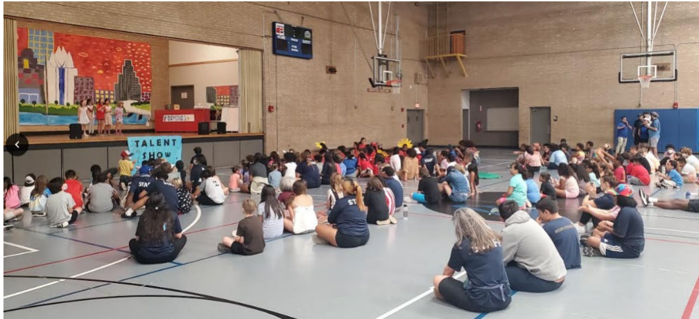
SAR Gym at the Summer Camp Talent Show

South Austin Recreation Center: Annual Summer Camp Talent show took place on Thursday, July 25, 2022. Over 200 campers and parents were in attendance from five different recreation centers. District 3