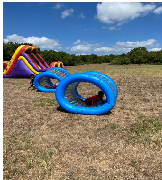
Youth participating in the inflatable wheel race