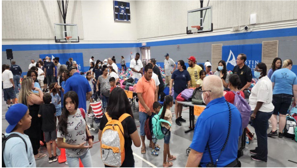
Community residents lining up to receive backpacks

George Morales Dove Springs Recreation Center: The George Morales Dove Springs Recreation Center held the first ever “Dove Park Madness” event on July 23, 2022, from 10 am-2 pm. This event was done in coordination with the previously mentioned Council office town hall meeting. Approximately 105 visitors attended this event and enjoyed a fun day of inflatable obstacle courses, carnival games and prizes. District 2