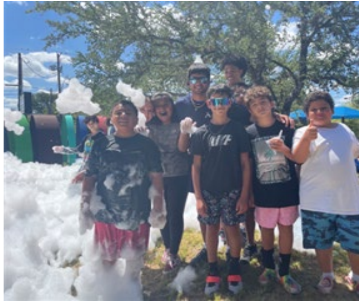
Montopolis Teen Group participating in Teen Challenge

Montopolis Recreation and Community Center: Montopolis Recreation Center hosted Summer Teen Challenge on July 29, 2022, from 10 am-12 pm. Teens from various recreation centers came together and participated in multiple games such as blow-up soccer, dart Nerf Gun war game and a fun foam pit. Snow cones and popcorn were given to attendees. 80 teens participated. District 3