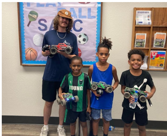
RC Car Club kids with RC Cars

South Austin Recreation Center: The Out of School Time (OOST) programs Sandlot Baseball and Radio Controlled (RC) Car Club has come to an end. Between the two programs 13 total participants enjoyed a new sport and found a new hobby. RC Club participants received a RC car to take home and Sandlot participants took home a new glove and baseball. District 3