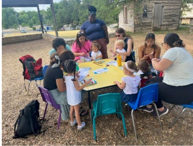
Delores Duffie Recreation Center toddler Leafy Learner program

Mendez Recreation Center: Mendez Recreation Center closed its summer Movie in the Park Series after six weeks of Friday night movies resented to the community. August 12, 2022 included Nickelodeon's Good Burger to cap off a summer series of movie watching under the summer sky. Special thanks to Sendero Healthcare for proving movie goers with food and snacks throughout the summer series event. Average attendance throughout the summer was 50. District 1