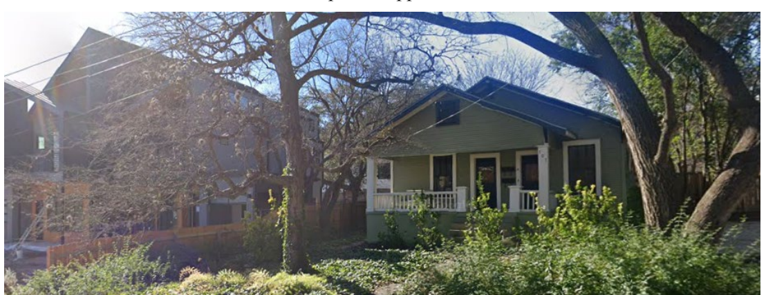
Google Maps, 2022