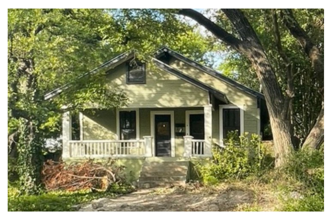
Demolition permit application, 2022