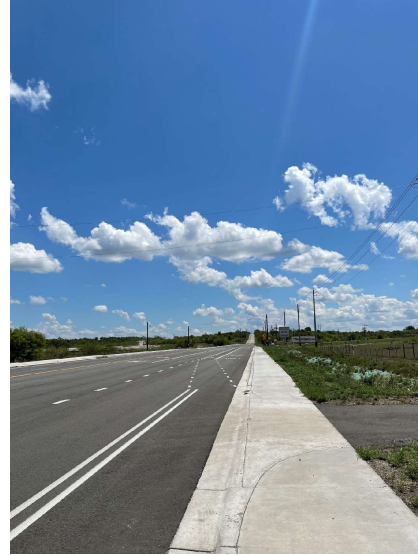
View of intersection toward East