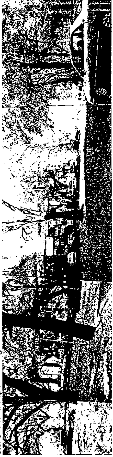
San Gabriel & Poplar Looking West