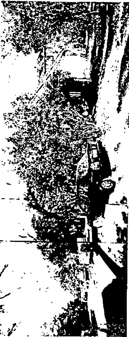
Poplar Looking North-West