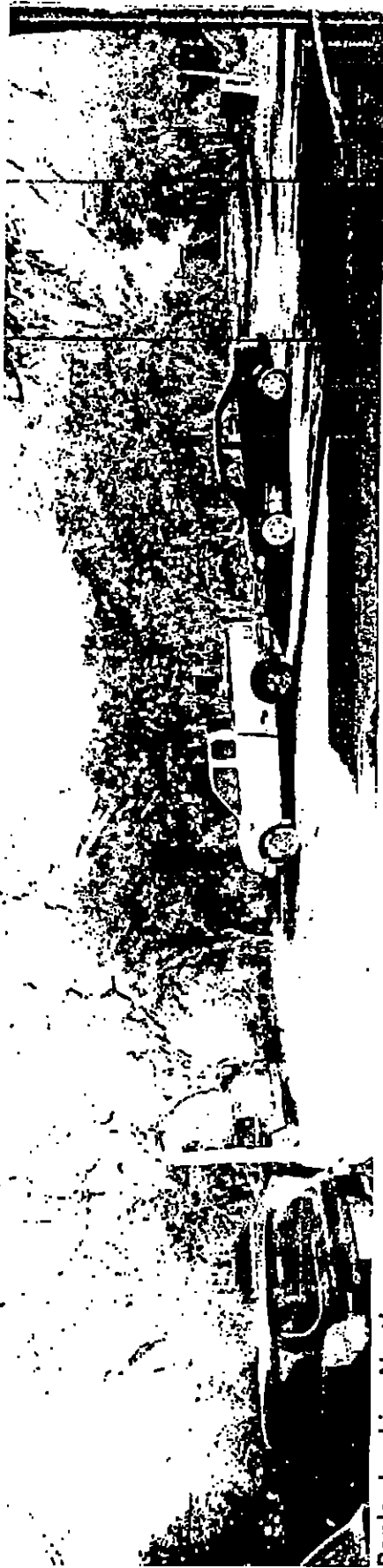
Poplar Looking North