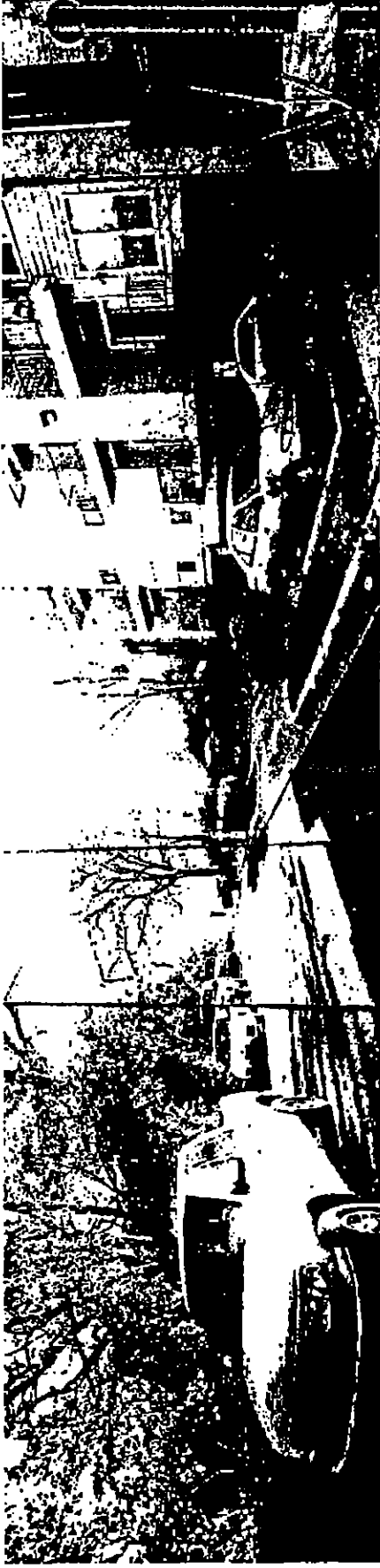
San Gabriel & Poplar Looking East