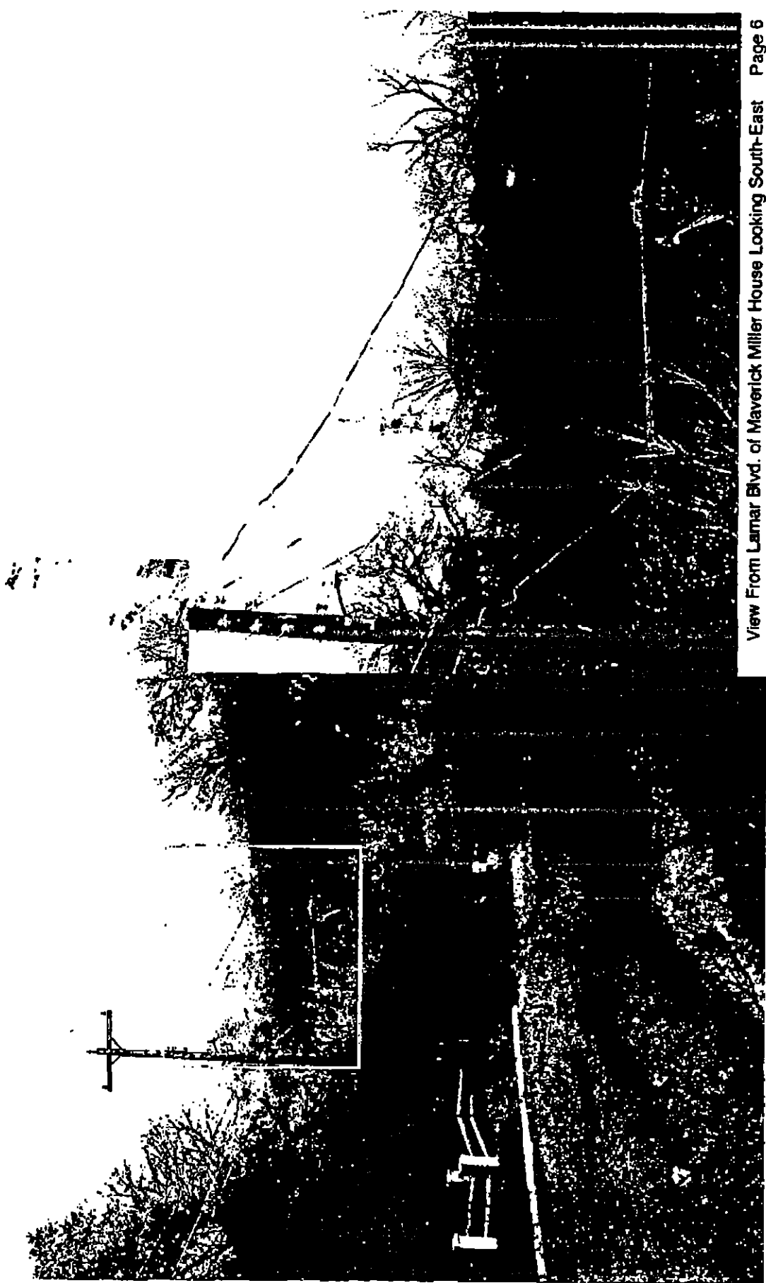
View From Lamar Blvd. of Maverick Miller House Looking South-East Page 6