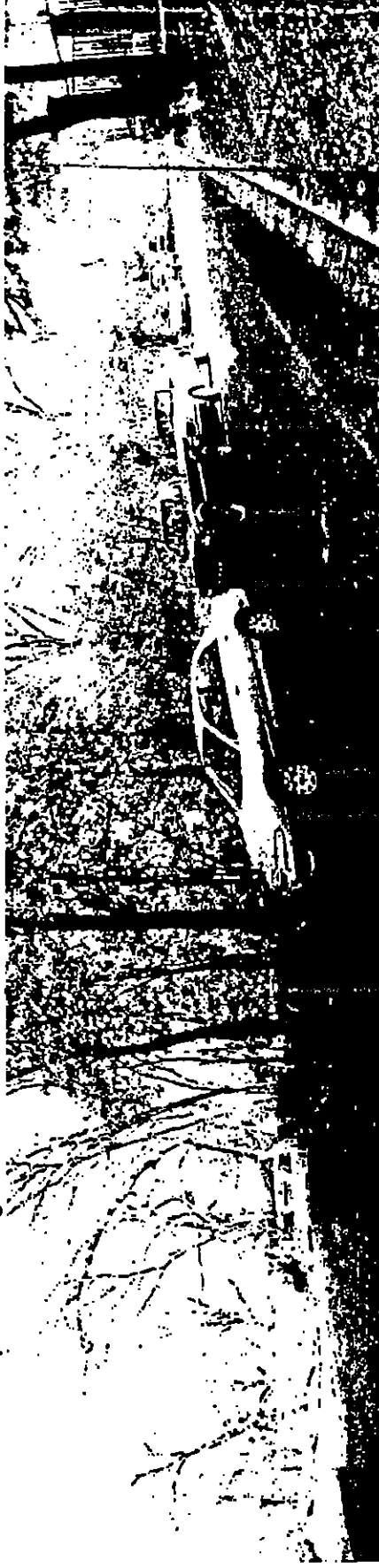
San Gabriel & Poplar Looking North-East