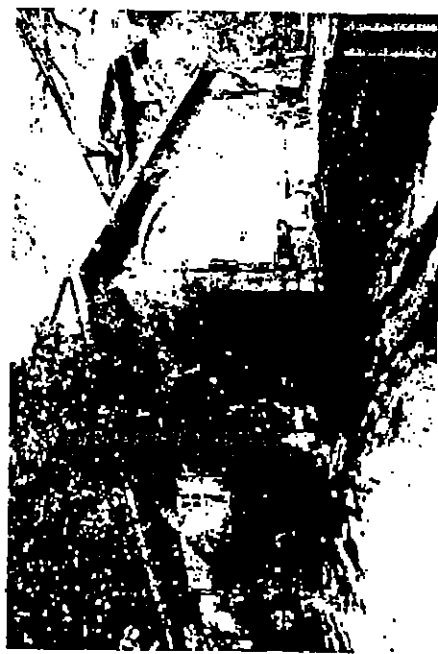
South East Oblique