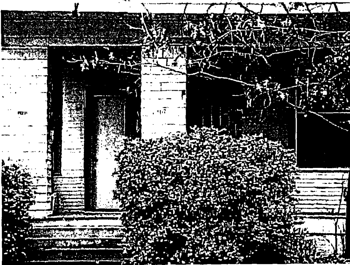
2807 Rio Grande Street Detail of front porch and entry