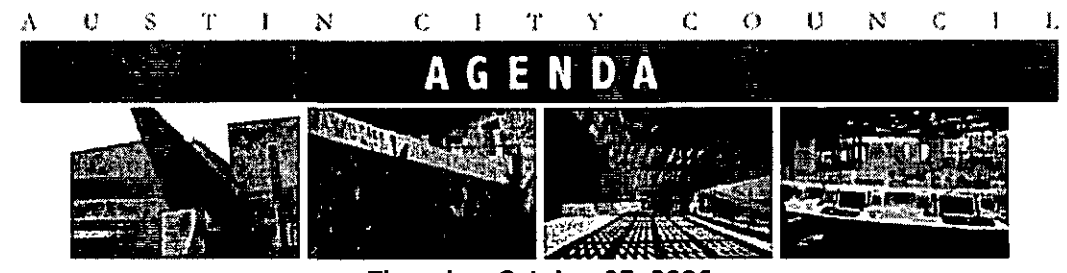
Thursday, October 05, 2006