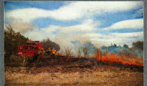
Fuels Reduction with Prescribed Fire