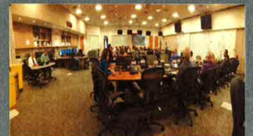
Joint Wildfire Task Force Meeting