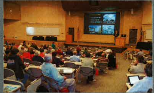
2013 Fire-Adapted Communities' Symposium

It's not if another major wildfire will occur but when .