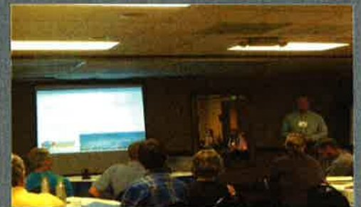
“Ready, Set, Go!” Planning Meeting