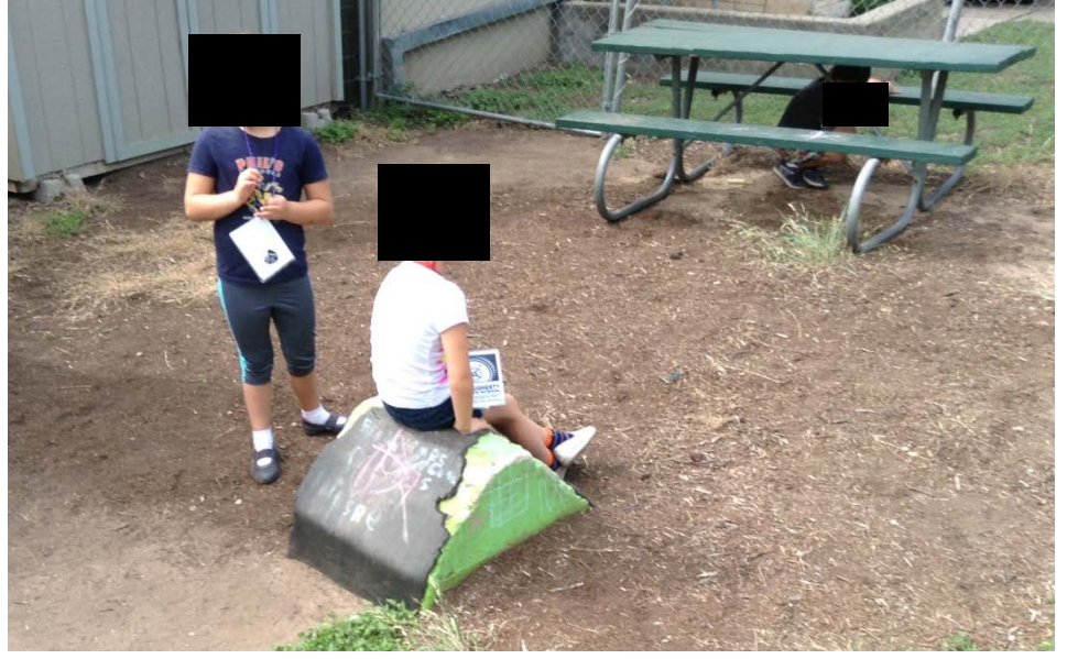
EXHIBIT 3 Concrete Safety Hazard at the DAC (Since Removed)

A safety issue at the Dougherty Arts Center (DAC) play area was identified by the site supervisor, Occupational Health and Safety Coordinator, and playground inspector. The hazard was partially addressed in the summer of 2013, only after a child injured his head and required stitches.