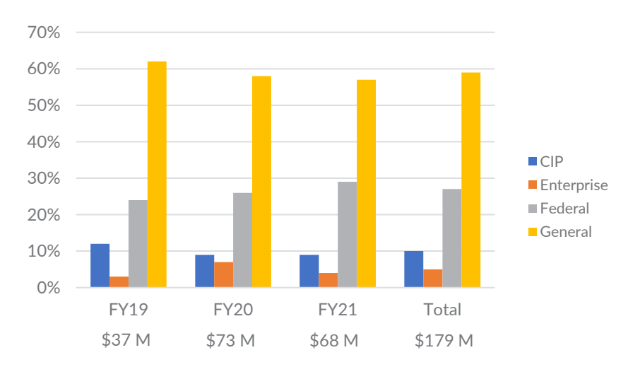
Exhibit 4: Overview of spending by funding type

While housing projects are funded with federal money, social services or case management agreements are largely funded with City money. Some agreements have mixed sources of funding, and some departments contribute money to agreements that other departments manage. Exhibit 4 shows an overview of spending by funding type.