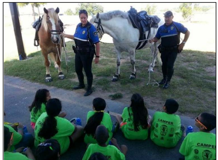
APD Demonstration for Youth Group