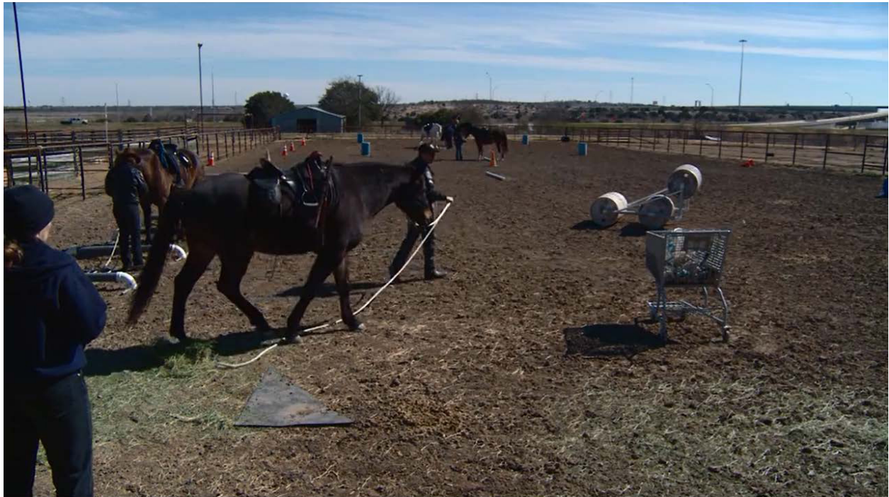
APD training horses at current facility

APD is designing and constructing a permanent equestrian facility for the APD Mounted Patrol Unit including equestrian accommodations, office facilities, training facilities, and ancillary support facilities located on 88 acres of APD owned property located at 11400 McAngus Rd. Austin, Texas 78617. The facility will service approximately 20 staff and 24 horses, which are taken as needed via trailers to patrol sites around Austin.