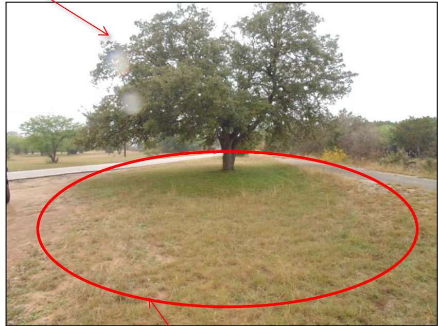
Main playground area