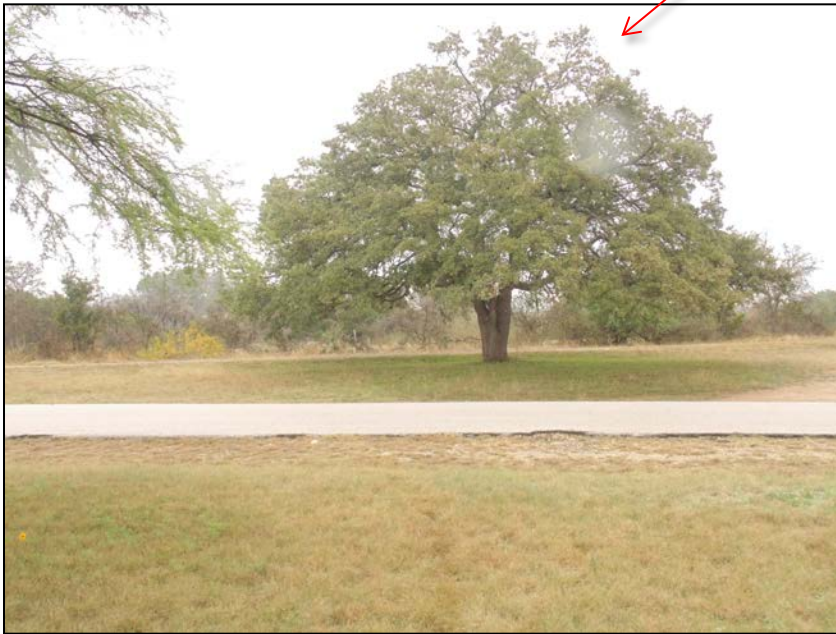
Center tree in playground area