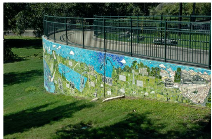
Deep Eddy Mural Project, 2011