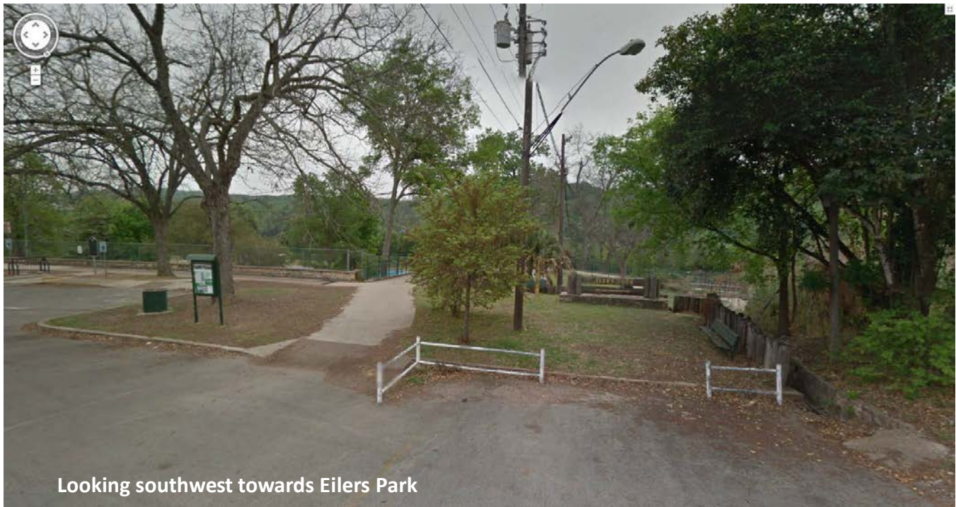
Looking southwest towards Eilers Park

The commissioned artist or artist team will be expected to coordinate with Design Workshop, the project team, and City staff in the design and installation of the artwork.