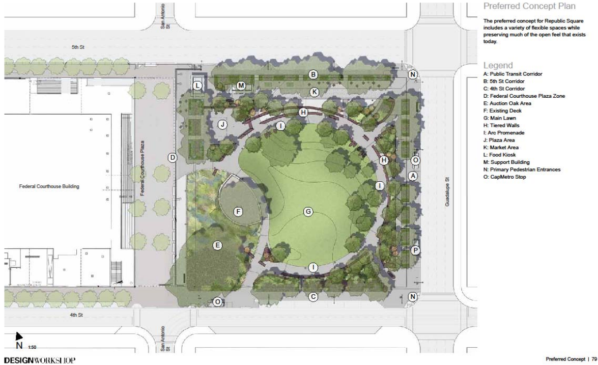
Preferred Concept Plan Site map

the partnership agreement in the public interest. More information on the Master Plan can be found at http://www.austintexas.gov/department/parks-and-recreation/projects .