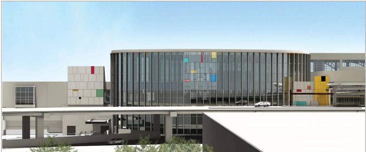
Exterior elevation, schematic design, Page Southerland Page