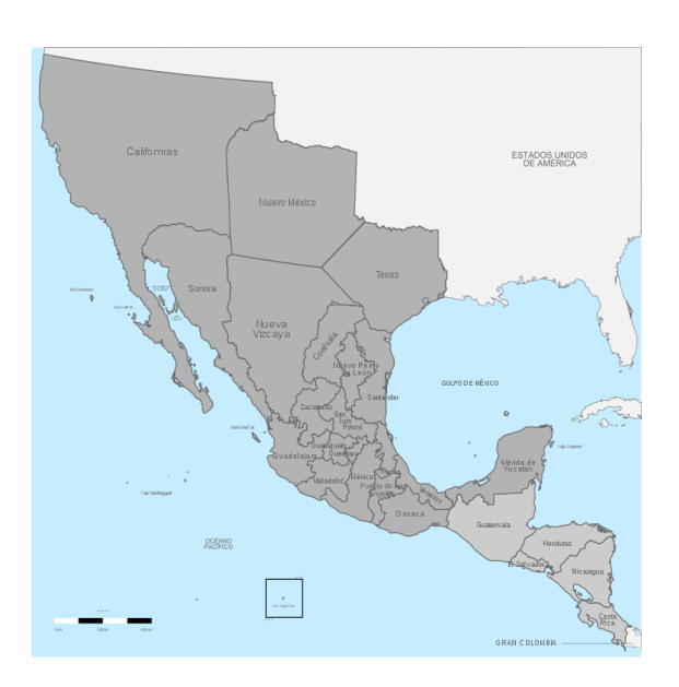
Map of the region of the first Mexican Empire, 1821.

owners looking to extend their potential for cotton and sugar production. Mexico's constitution forbid slavery but the governor of Coahuila made an exception for "property" brought into the state, knowing it would be an economic boon to the region.