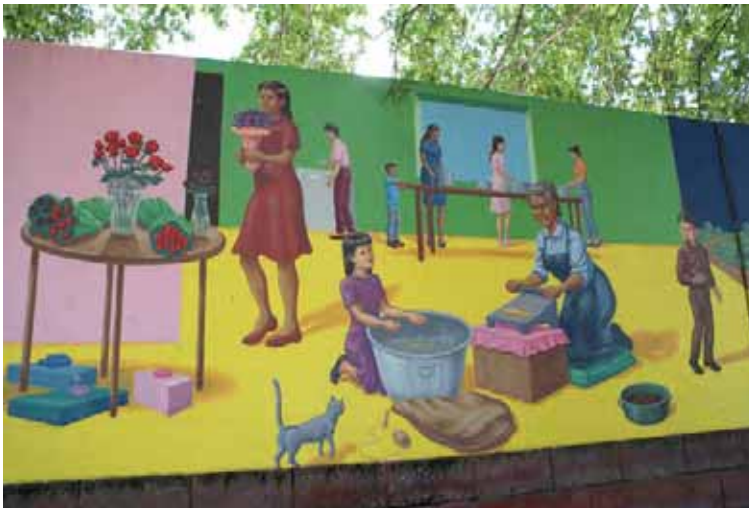
La Quinceanera. Holly Power Plant murals. Artist Fidencio Duran. 1992.

Continue the Legacy of a Vibrant Neighborhood Arts Culture: While the history of the neighborhood has been one of struggle, it is also one of Saturday picnics, dances, and festivals. Art has the potential to not only capture the larger historical trials, but the everyday joys of neighborhood living that are felt today within the music, murals, and food of the area.