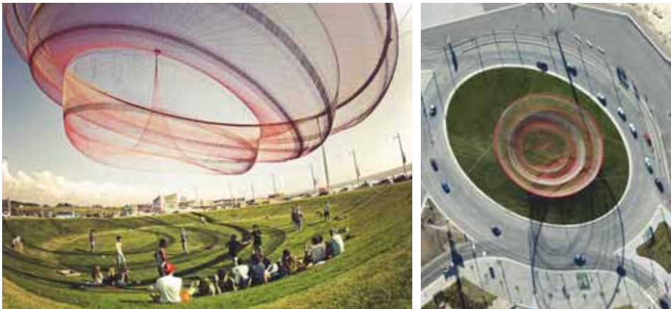
She Changes . Artist Janet Echelman. Porto, Portugal. 2005.

Unique to Zone One, stand-alone, iconic artworks would greatly contribute to future improvements. The density of built elements and high level of activity call for artworks with a considerable presence and scale. When placed effectively, these artworks can become landmarks and attractors. They can contribute to or create new axial patterns, symmetry, and other spatial organizations. For example, an iconic piece located between Fiesta Gardens and the proposed steps and deck along the lagoon would reinforce an axial pattern directing views and movement between the lagoon and Jesse E. Segovia Street.