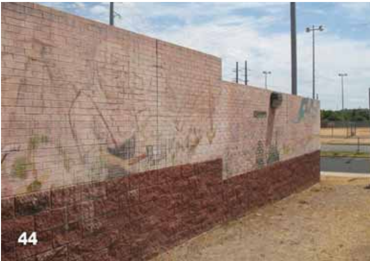
Not AIPP; not commissioned.