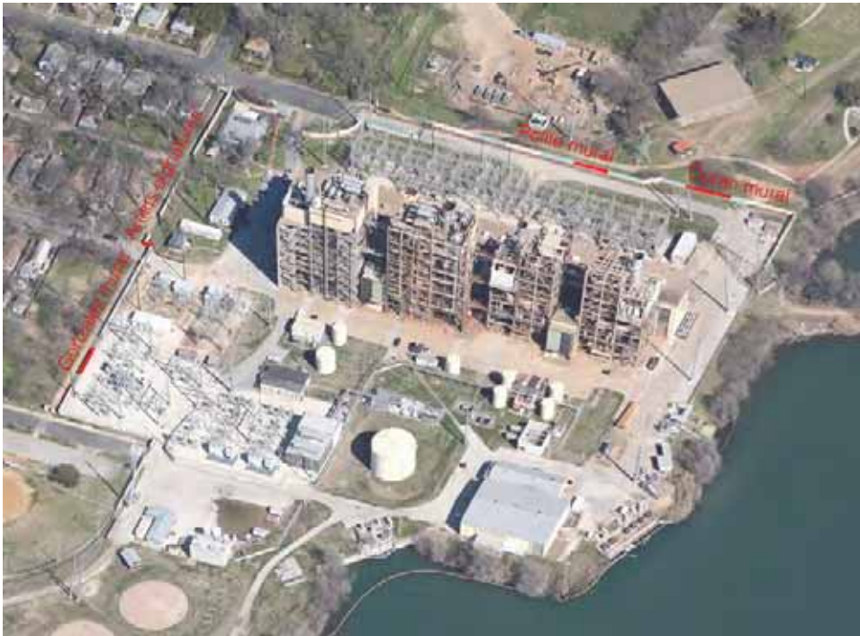
Murals recognizable upon review in 2013 at the Holly Shores Power Plant.

Ambray Gonzales' mural the Progress of Civilization is most recognizable and should be documented within the deaccession process. Due to graffiti, fading, and damage, the four additional murals are beyond recognition. With minor damage, the seven artists' signatures are located on a singular panel at the entry to the Power Plant on Haskell Street.