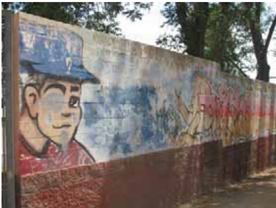
Example of mural damage and graffiti, as of October 2011. See Appendix G for additional information and images.

Ambray Gonzales' mural the Progress of Civilization is most recognizable and should be documented within the deaccession process. Due to graffiti, fading, and damage, the four additional murals are beyond recognition. With minor damage, the seven artists' signatures are located on a singular panel at the entry to the Power Plant on Haskell Street.