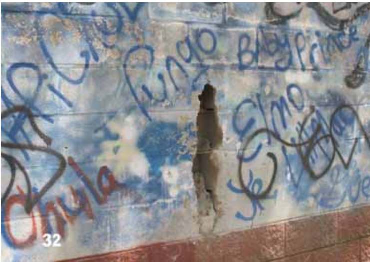
Structural damage; not commissioned.