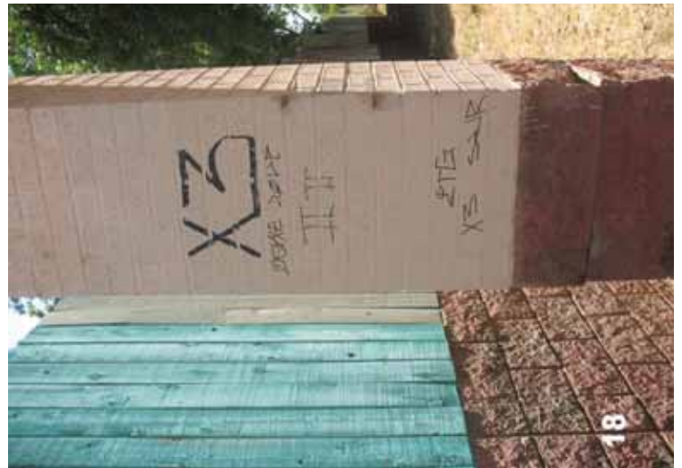
Graffiti - paint over