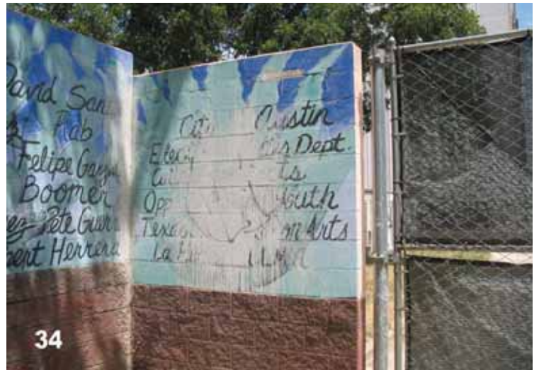
Signatures of commissioned artists.