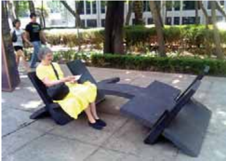
Public benches. Mexico City, Mexico. 2007.

In Zone One, functional art, or art which serves a usable function, could be readily incorporated in future improvements. Examples of functional art include: shade structures, bike racks, seating, fencing, signage, and gates. The Parks and Recreation Department and their designers should look for opportunities to integrate functional art as they move from the master plan stage to design implementation. Incorporating amenity-based art also provides a budgetary advantage, as monies allocated to public art can be combined with construction funding.