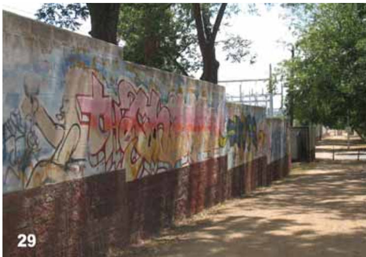
Not original; painted over "The Children Are Our Future" (AIPP)