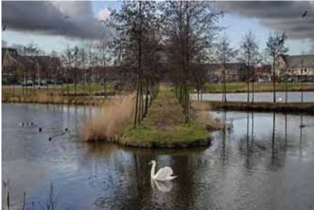
Walburg Project. Artist Lucien den Arend. Zwijndrecht, Netherlands.

Functional art in the area, especially new accessible park features would improve access and enjoyment of the park for residents and visitors alike. These functional pieces might include seating, picnic benches, signage, walking surfaces, and shade structures.