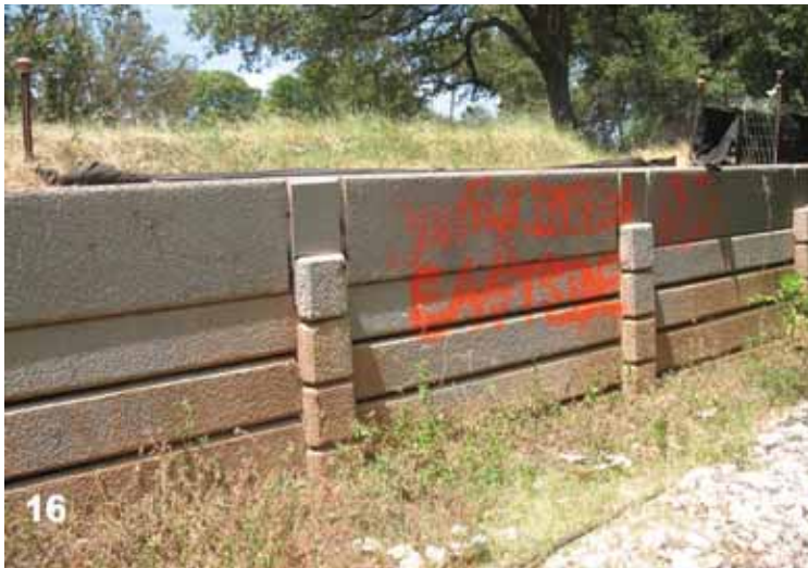
Graffiti - paint over