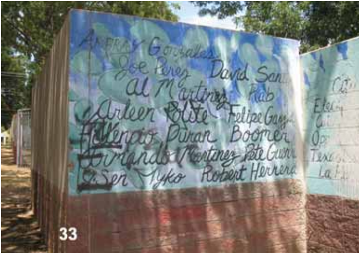
Signatures of commissioned artists.