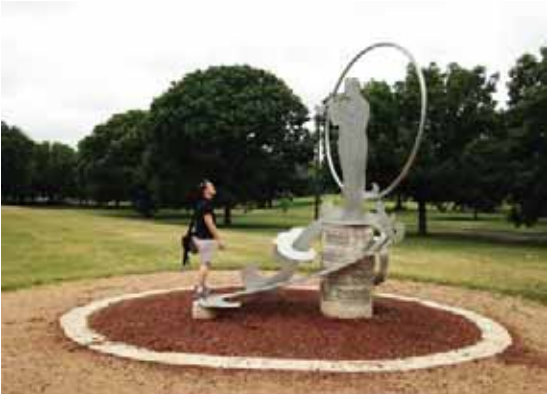
Tenderly . Trail of Tejano Legends. Artist Connie Arismendi. 2008.

In addition to the power plant murals, the Trail of Tejano Legends is an additional series of publicly commissioned artworks in East Austin. The Trail and the associated public art pieces celebrate local Tejano musicians of the 1940's and 1950's, many of who grew up in the Holly and East Cesar Chavez Neighborhood areas. Two of the four sculptures by Artist Connie Arismendi are located in the master plan area. !Estamos en Tejas! and Tenderly , completed in 2008, are important landmarks within the park.