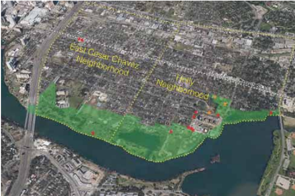
Aerial image of the East Cesar Chavez and Holly Neighborhoods with the master plan area, highlighted in green. Existing City-owned public art is noted, with the AIPP collection highlighted in red and the Cultural Heritage Collection highlighted in orange.