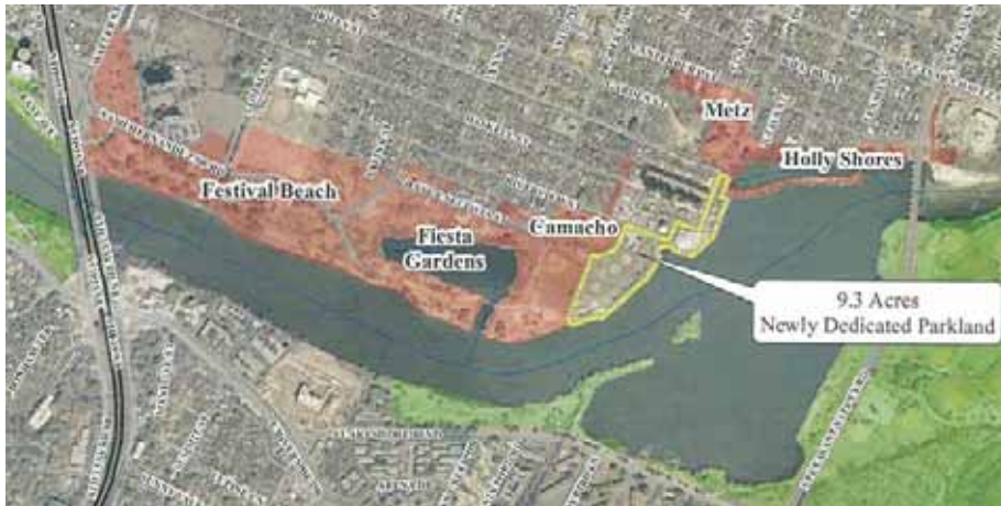
Holly Shores Master Plan area: existing parkland highlighted in red, newly dedicated parkland outlined in yellow.

We will gather with artists who are from, or have worked in and around, the Holly neighborhood, to talk about how the visual arts currently serve Austin's East Side neighborhoods. Join this team of Designers to explore the site together and give your input.