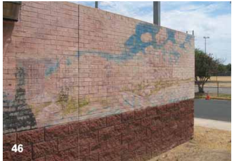
Not AIPP; not commissioned.