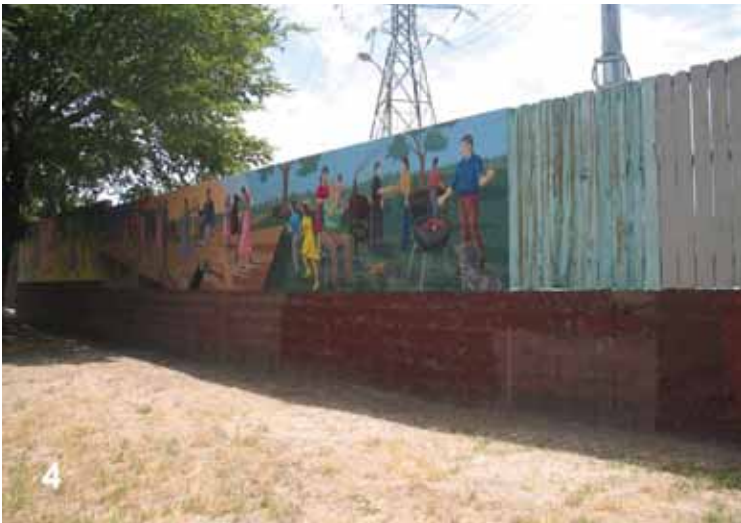
"La Quinceanera" by Fidencio Duran (AIPP) KEEP