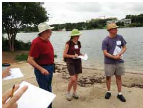
Left: Artists and local residents explore the master plan area with GO collaborative consultants.