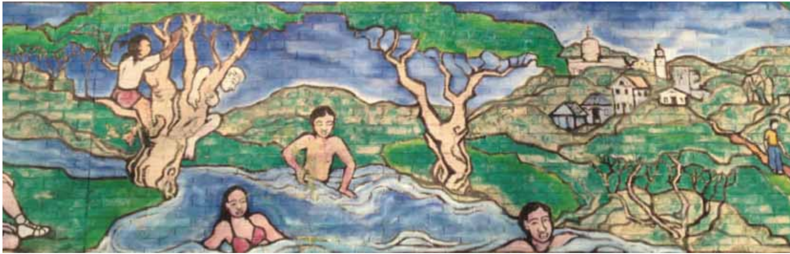
Untitled. Holly Shores Power Plant murals. Artist Arleen Polite. 1992.