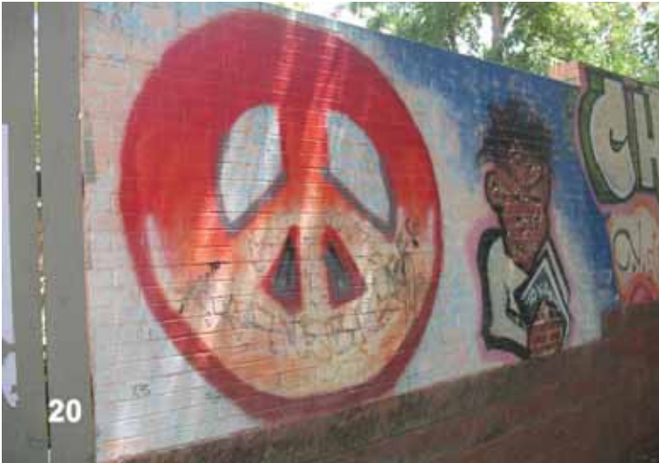
Possibly part of "The Children Are Our Future" (AIPP) DAMAGED