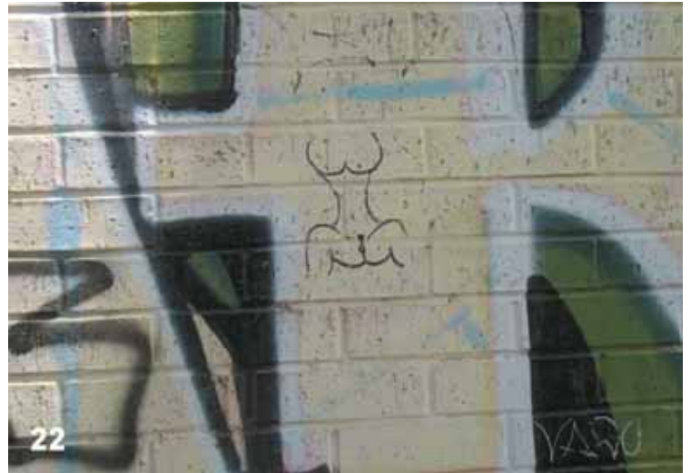
Can paint over obscene graffiti by matching paint.