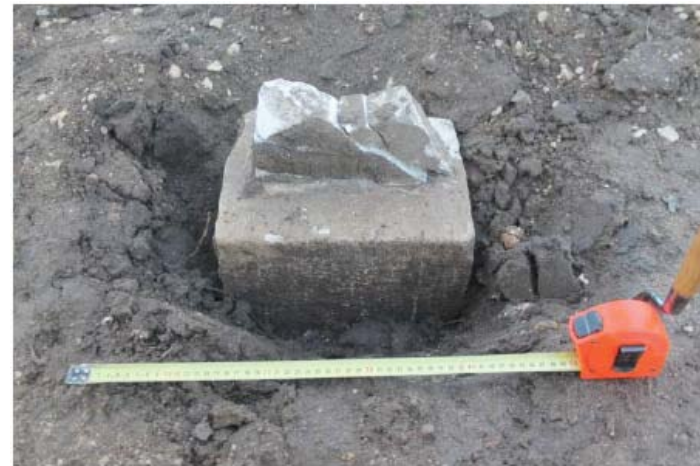
Figure 1: First headstone discovered north of the chapel.