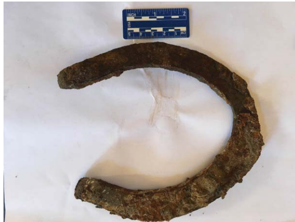
Figure 6: Iron horse shoe