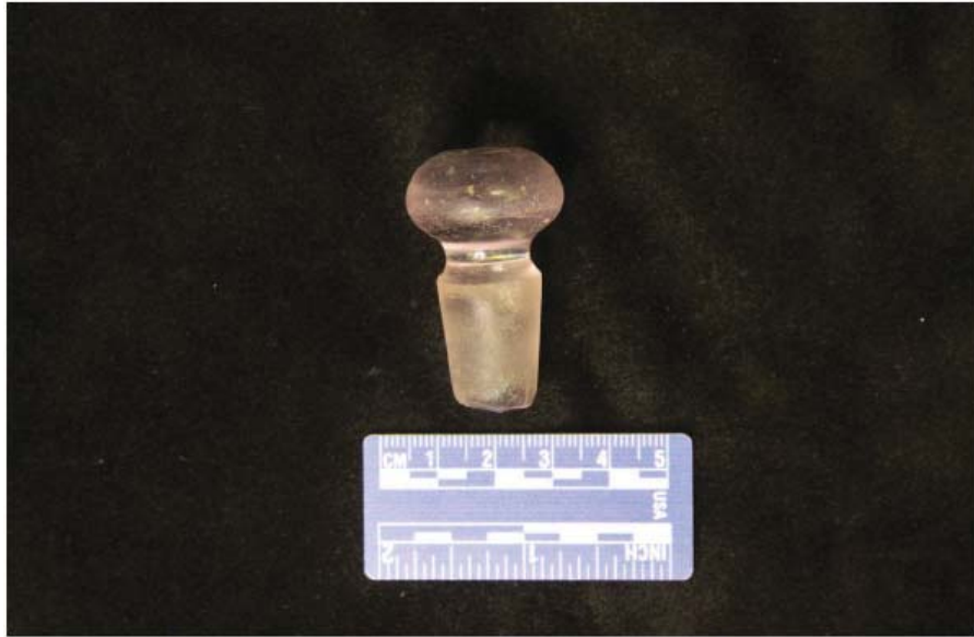
Figure 13: Solarized amethyst glass stopper from Block C.