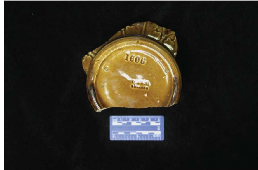
Figure 15: Stoneware base with maker's mark.