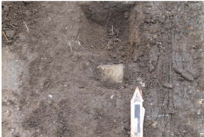
Figure 5: Headstone uncovered in scraping Block A north of chapel.