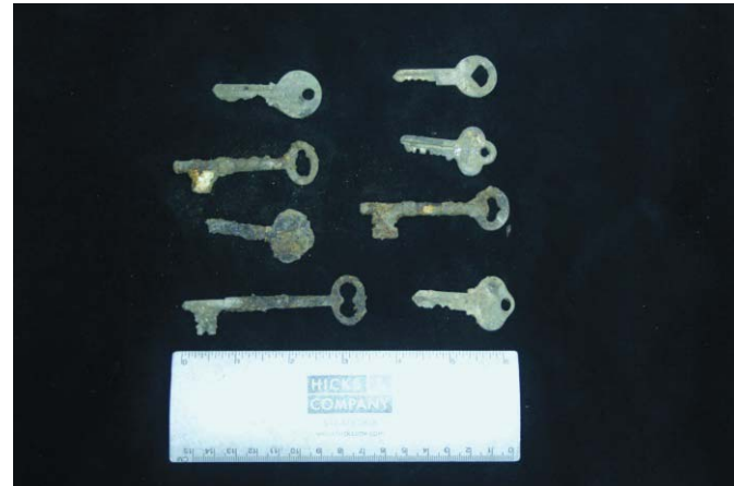
Figure 1: Assorted Keys