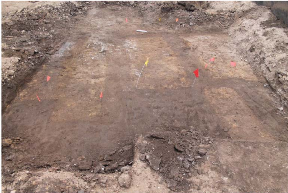
Figure 7: Burial stains in Blocks B and C; facing west from eastern edge of Blocks B and C.