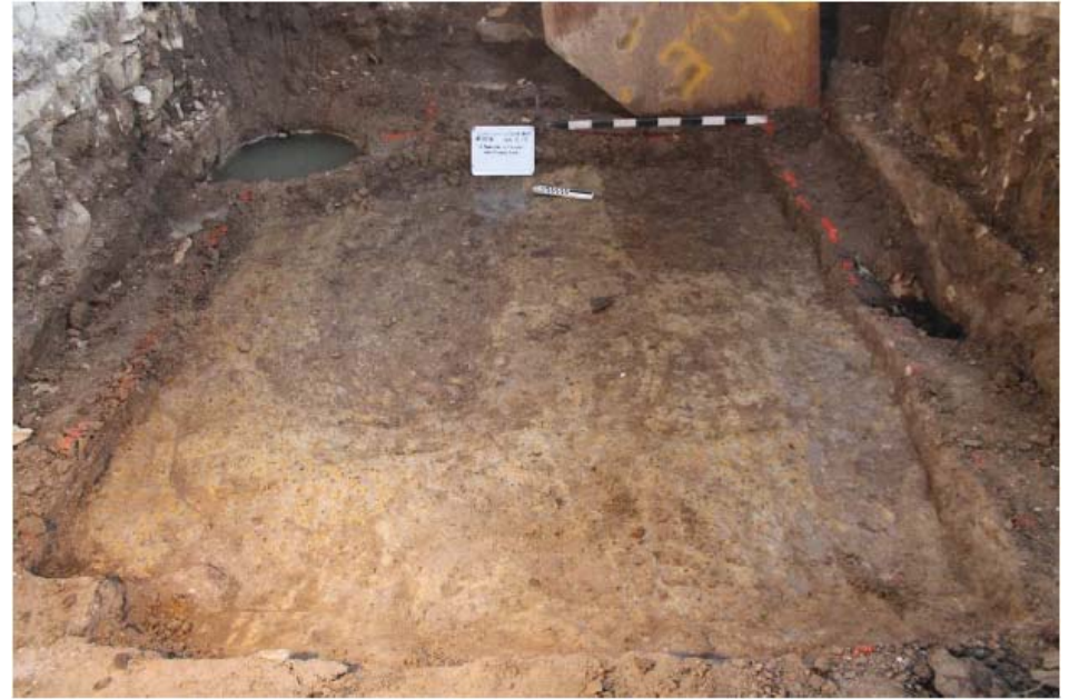
Figure 3: Burial stains in tower room of chapel, facing east.