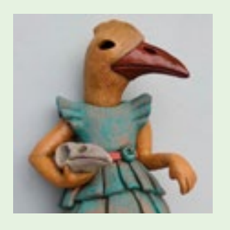
Grim Re-Articulated - Marianne Levy June 12 – July 25, 2020 Reception: Friday, June 12, 6-8pm Artist Talk: Wednesday, July 8, 7pm Levy creates ceramic figures inspired by some of the more well-known Grimm fairy tales, and combines animal imagery with reimagined configurations of these characters to form a feminist perspective.

supporting and challenging the Myth of Manifest