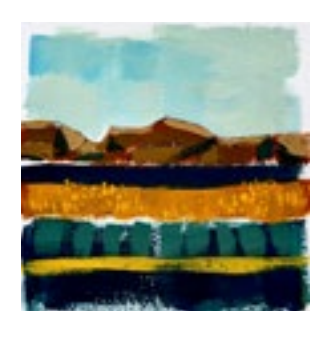
May 2 - June 6, 2020 Reception: Wednesday, May 13, 7 - 9pm Artist Talk: Wednesday, May 27, 7pm Luna has created a series of tranquil paintings inspired from photographs taken on road trips through Texas, New Mexico, and Arizona.