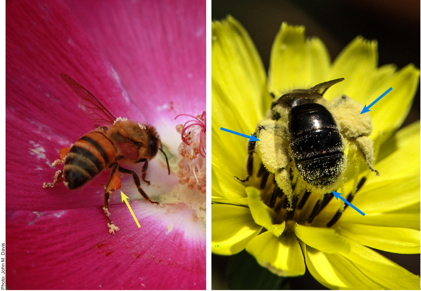
Honey bees (left) carry pollen neatly in pollen baskets (corbicula) on their hind legs, while native bees (right) often have long specialized hairs (scopa) on their legs and abdomen that become packed with pollen. This is one of several factors that make native bees much more effective pollinators.