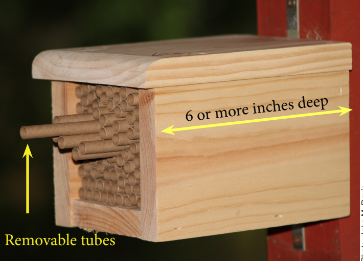
Solitary bee nesting structures can be purchased or made. Just be sure to use tubes or blocks that can be removed and cleaned or replaced after each season.

Artificial nesting structures are great ways to allow close observation. Unlike honey bee hives, no expert skills or special professional clothing are needed to manage artificial structures for native solitary bees. Managing honey bees requires expensive hives and bee suits, while the typical investment in solitary bees is $50-$200. Honey bee hives require year-round maintenance while managing native solitary bees requires 2 hours a year.<sup>19</sup> To keep native bees healthy, simply replace nesting tubes when bee offspring emerge from the previous year's tubes or disassemble the nesting block and clean it to prevent parasites and disease transmission.<sup>19</sup> See the Resources section for tubes.