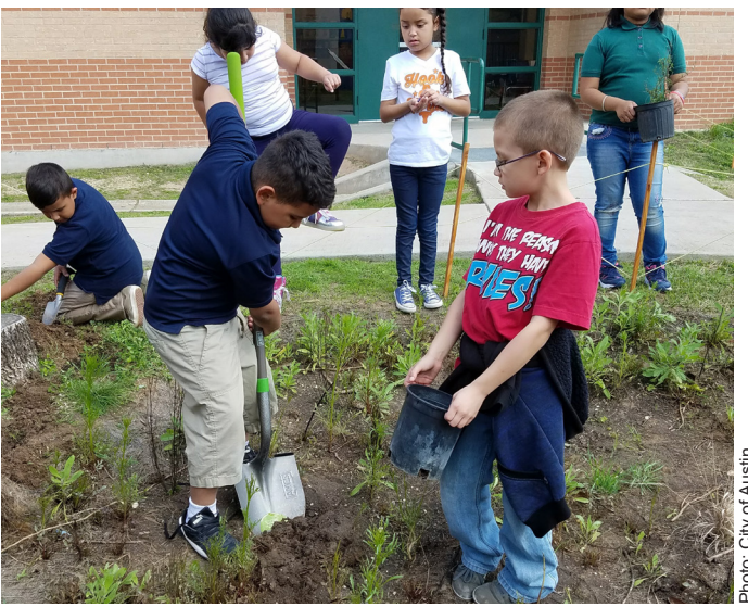
Central place foraging by native bees creates a direct tie to students' actions.