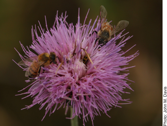
The European honey bee is an introduced species that is thriving worldwide, impacting native bees across the globe.