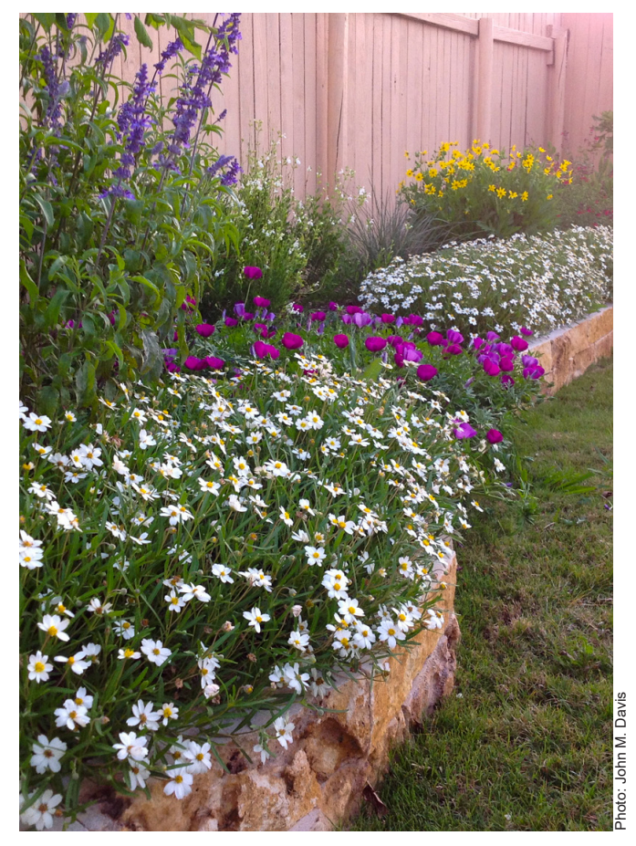
Landscaping with a diversity of native plants is a great way to help native bees.

Once your school has created pollinator habitat, manage it well to consider the needs of native bees while reducing threats.<sup>24</sup> Avoid pesticides, especially neonicotinoids ("nee-oh-nik-oh-tinoids"). This category of pesticide acts on the nervous system and is very toxic to invertebrates. It is applied to the soil, absorbed into plant tissues, and kills invertebrates that feed on plants. See the text box above for more detail on these pesticides. The active ingredient may be sold in products with various brand names.