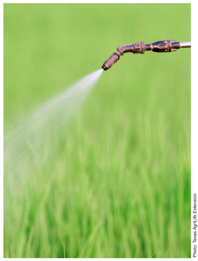
Insecticides kill insects. Avoid using chemicals that impact pollinators.