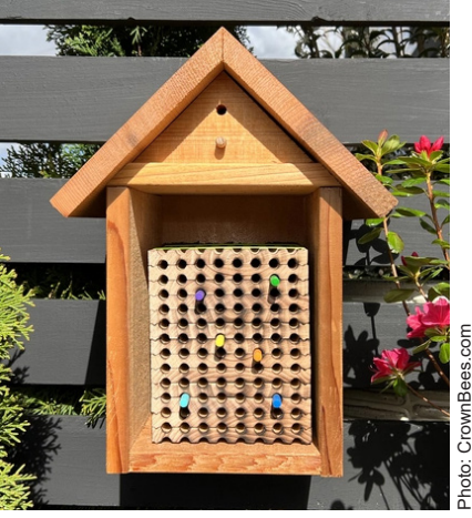
Nesting blocks are inexpensive and easy to install and maintain.