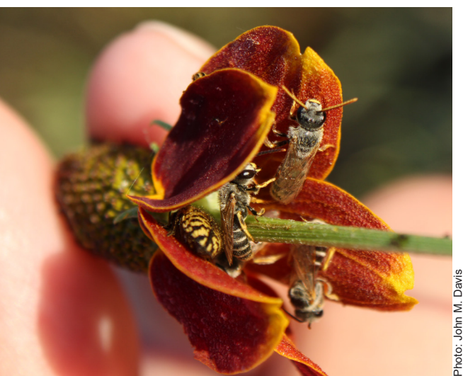
Native furrow bees huddling under the only remaining upright prairie coneflower after a wildflower meadow was mowed.