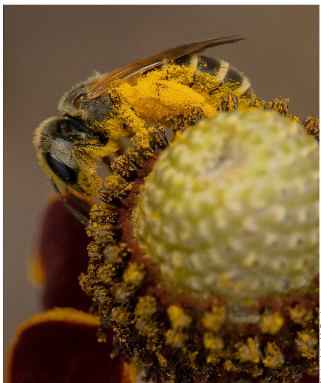
A small furrow bee with legs and underside covered with pollen.

Native bees are pollinator powerhouses! Researchers have estimated they are up to 300 times better pollinators than European honey bees.<sup>18,19,20</sup> Native bees visit more flowers per minute than honey bees and their body structure and behavior facilitate greater pollen transfer among flowers. Additionally, native solitary bees remain active under worse weather conditions than do honey bees. All these advantages lead to higher levels of seed set and higher fruit and vegetable yields when native bees do the work.<sup>19,21</sup>