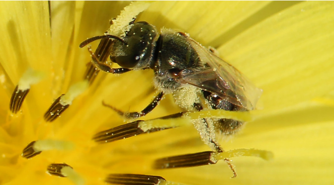
Tiny bees like this 4mm sweat bee (genus Lassioglossum) forage just a few meters from their nest site.

As "central place foragers," native bees are your personal pollination army!