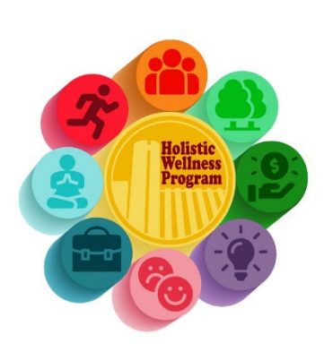
More info at MYMACC.org

Announcing our newly created Holistic Wellness Program! We are kicking off the New Year with 20 classes on the 2023 calendar! All classes are bilingual – English and Spanish. A community survey will be completed in January to gather feedback and ideas on additional programs to be added beginning in the Spring 2023.