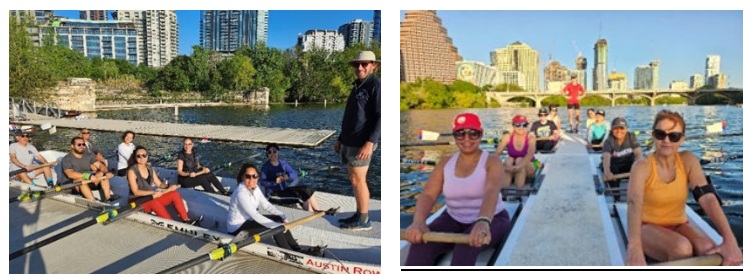
<u>Learn to Row (18+)</u>: Thursday, March 28 @ 6-7:30pm (Attendance: 16) Austin Rowing Club

A gentle form of yoga that can be done while seated in a chair. These modifications make yoga accessible to people with various physical capabilities.