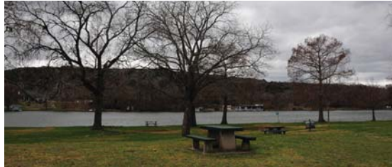
Open Lawn for Picnicking

In addition to providing a space for organized activities, the Park has active and passive recreational activities that attract people of all ages. Picnicking, swimming, boating, camping, fishing and sports are among the most popular activities provided within the Primary Use Area.