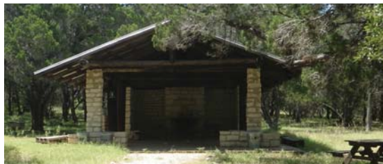
Turkey Creek Pavilion