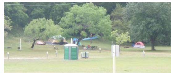
Tent Camping along the Bluff