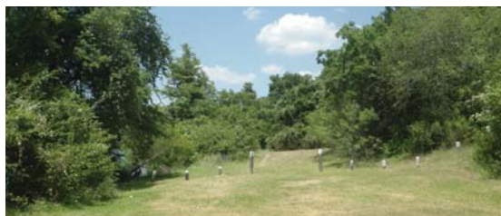
Connection to Nature Trails