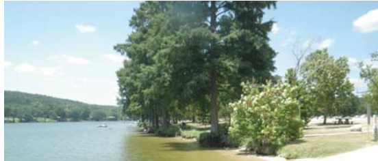
Access to Lake Austin

The Park is home to many planned community activities and provides program elements that attract people to the park on a year-round basis. Boy Scouts camping trips, neighborhood meetings, birthday parties, weddings and family celebrations are just a few of the organized activities that occur at the Park each year.