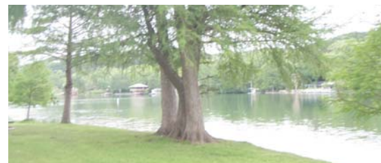
Fishing along the Shoreline