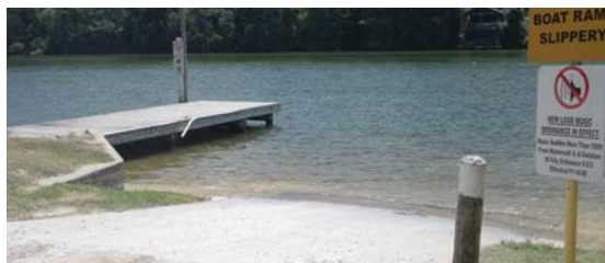
Boat Ramp and Dock