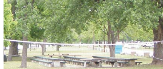
Reservable Group Picnicking Area