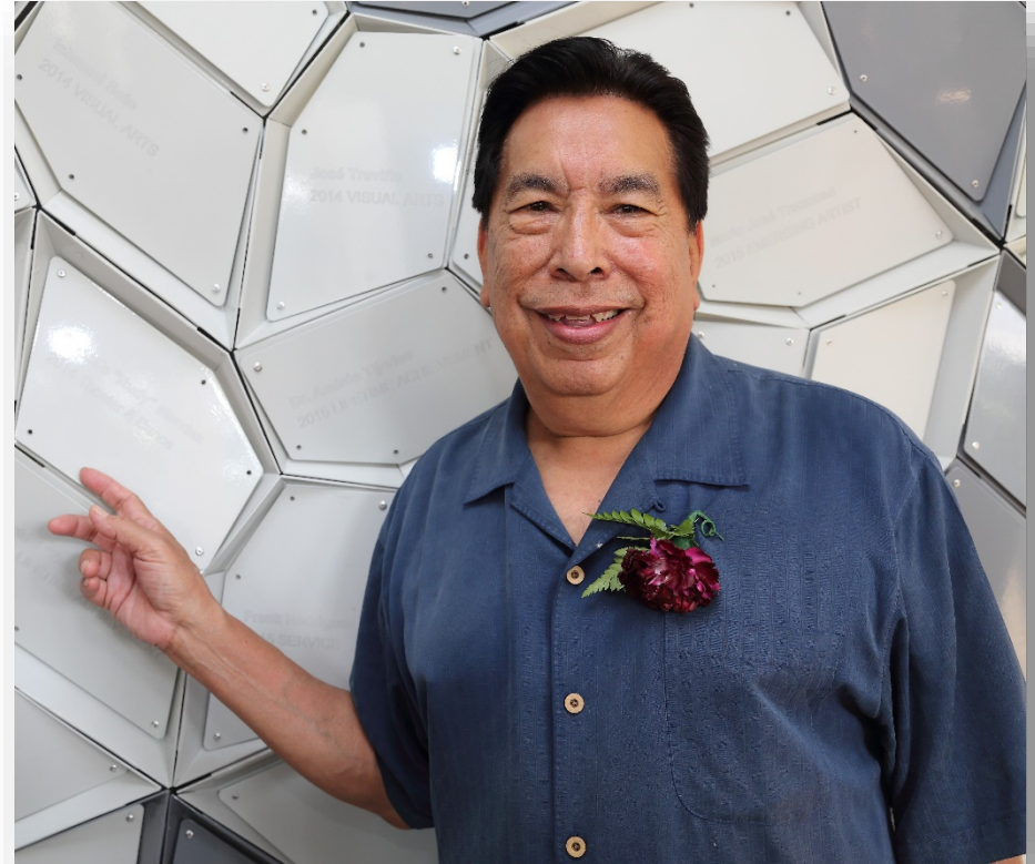
City of Austin Parks and Recreation Department