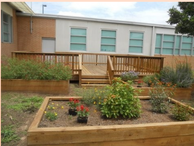
Deck and Butterfly Garden