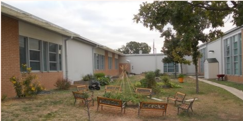
Vegetable Gardens and Classroom Space

Teachers and students have access to a Peace Garden, vegetable gardening with compost and a solar powered pond, a butterfly garden and a deck off the library for reading and explorations of nature. Pickle is a model campus for integrating vegetable gardens and native habitats into an outdoor learning space to accommodate a variety of wildlife while making the best use of the space. Pickle ES received a grant from CiNCA to continue the greening of their schoolyard in the 2012-2013 school year by installing a rain garden and making existing learning spaces more accessible to all learners.