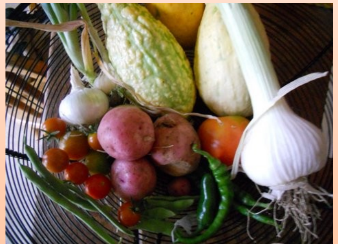
Bounty from the Pickle Gardens