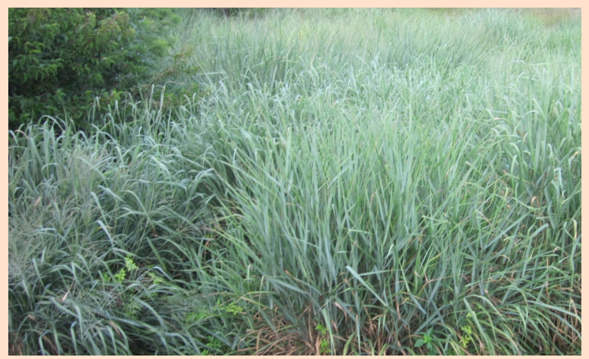
Native switch grass near the retention

gardens as well as studying the developmental effects of play in young children. The gardens within the school are all connected so the over 500 students can roam the grounds, play with the school's rabbits, visit the playground or garden. Thank you so much to Redeemer Lutheran School,