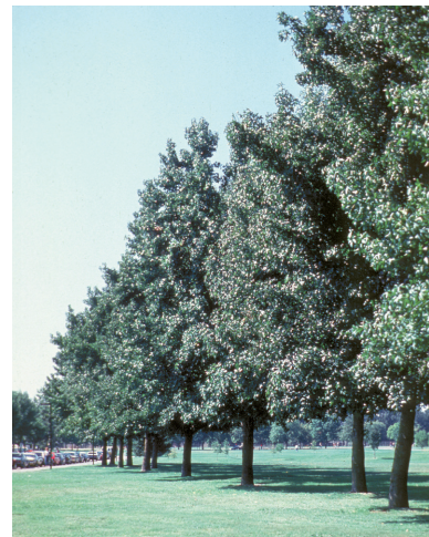
American Sweetgum (Liquidambar styraciflua)