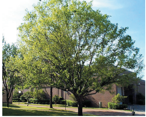
Lacebark Elm (Ulmus parvifolia)