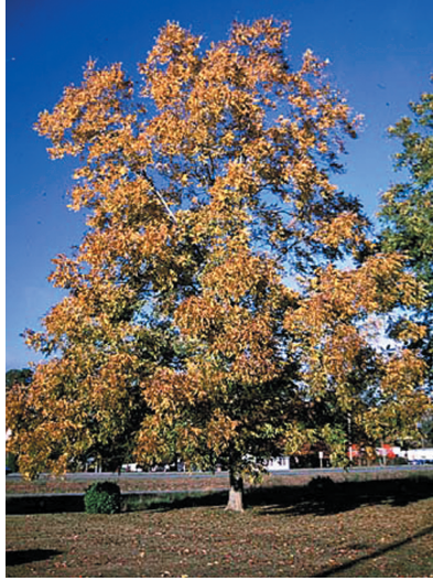
Pecan (Carya illinoensis)