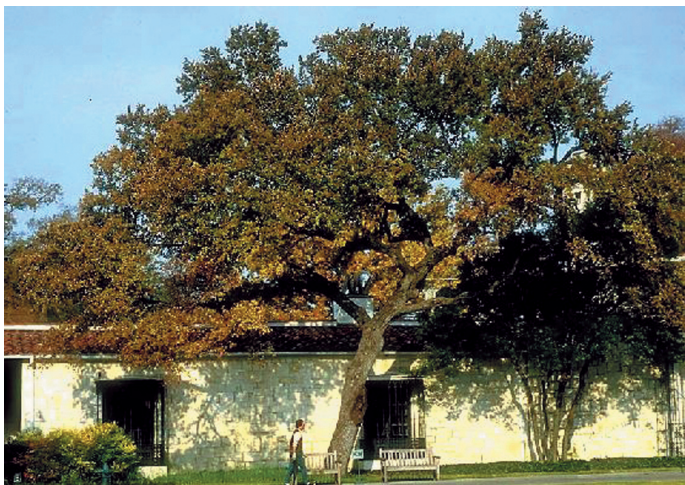
Cedar Elm (Ulmus crassifolia)