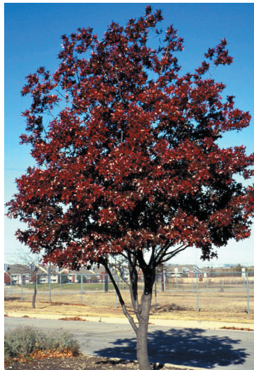
Texas Red Oak (Quercus texana)