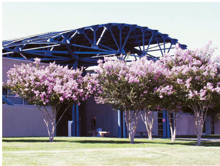
Crape Myrtle (Lagerstroma var.)