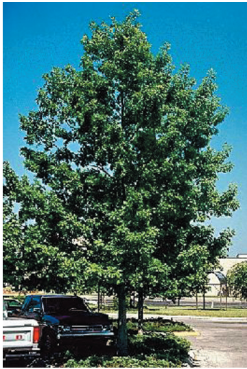
Shumard Oak (Quercus shumardii)