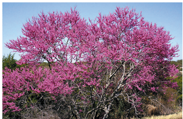
Texas Redbud (Cercis canadensis var. texensis)