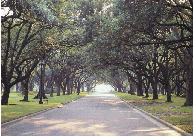
Southern Live Oak (Quercus virginiana)