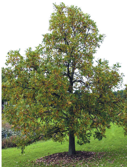
Bur Oak (Quercus macrocarpa)