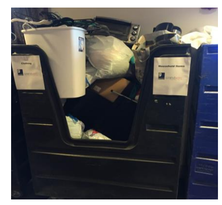
Donation bins for household items.

Austin Resource Recovery's Business Outreach Team offers free consulting services to help businesses reduce waste, recycle materials and comply with Austin's Universal Recycling Ordinance (URO). Please contact us at: (512) 974-9727 or commercialrecycling@austintexas.gov