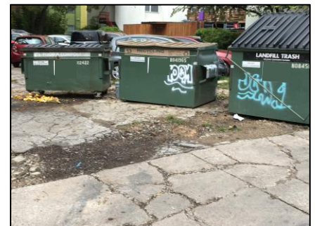
Pearl St. Co-Op dumpster area (compost, recycling, and landfill) before sharing services.

Success Factors. A tenacious operations director, a collaborative approach between the organizations and a desired common interest to alleviate shared challenges helped make this a successful project. Involving the hauler from the beginning, and working closely throughout the process also helped ensure success. Buy-in from the Co-Op board members and both businesses was also critical.