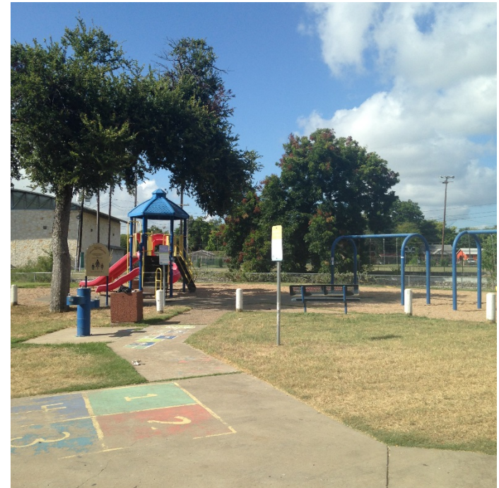
Current Parque Zaragoza Playscape