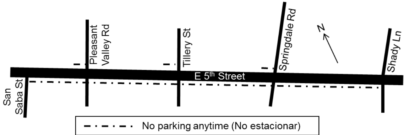
Figure 2 – E 5 th Street Road Project Area

In order to ensure the most appropriate allocation of street space, ATD is seeking feedback from local residents and other users of this street prior to determining final plans. You can obtain additional information about this mobility project and provide feedback at an open house on Tuesday, February 14, 2017 from 6 pm to 7 pm at the Cepeda Branch Library, 651 N Pleasant Valley Road, Austin, Texas 78702 . Feedback based on local experience frequently results in improvements to initial project proposals. If necessary, modifications to this proposal can be made after input is received at the open house.