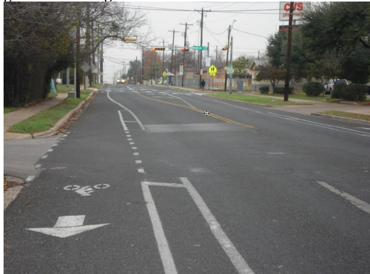
Figure 1 – Existing Conditions on Berkman Drive at Briarcliff

The following is a high level summary of feedback from the first transportation open house for Berkman Drive as well as feedback provided by residents of Windsor Park to the District 4 Council Office: