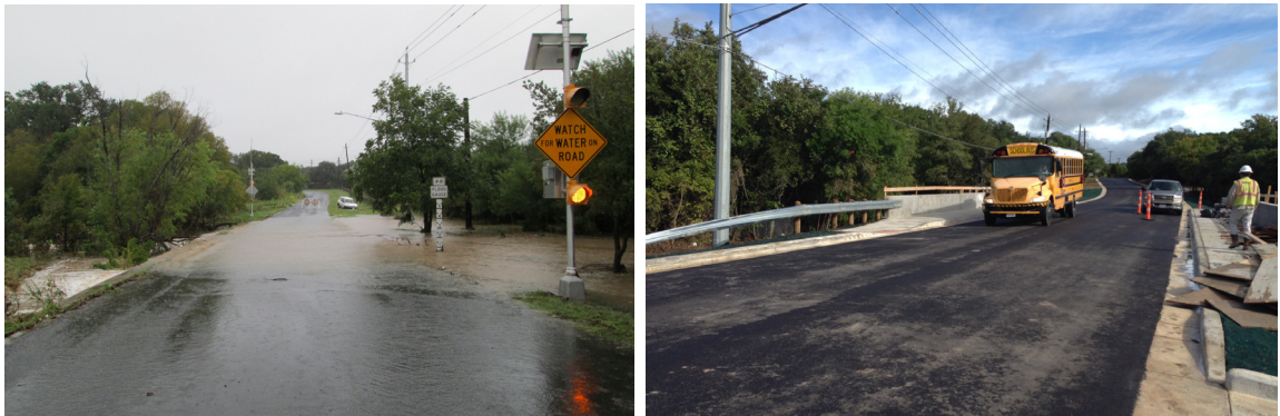
David Moore Drive before (left) and after (right) the project's completion

The street also serves as secondary access to 14 residential subdivisions south of the low-water crossing. When David Moore was inaccessible due to flooding, there was only one available access route to more than 800 buildings within these subdivisions. If the primary access became inaccessible during a storm, emergency responders would not be able to access the subdivisions.