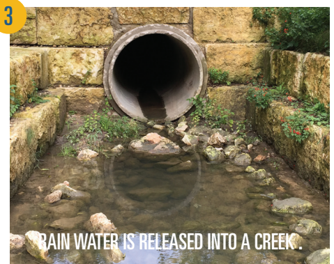
RAIN WATER IS RELEASED INTO A CREEK.