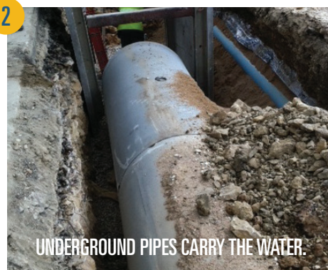
UNDERGROUND PIPES CARRY THE WATER.