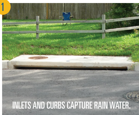
INLETS AND CURBS CAPTURE RAIN WATER.