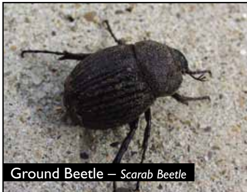
Ground Beetle – Scarab Beetle