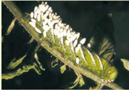
Parasitic wasp pupae on a tomato hornworm