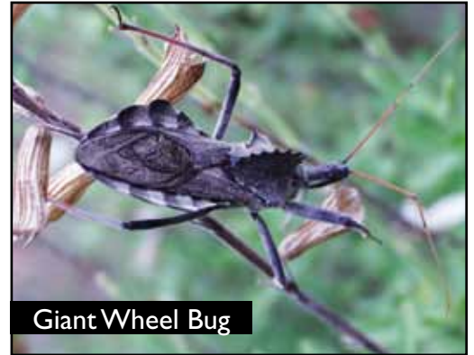
Giant Wheel Bug