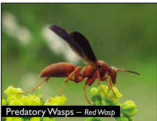
Predatory Wasps – Red Wasp