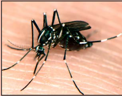
Adult Asian tiger mosquito