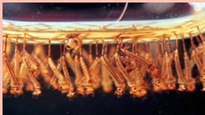
Mosquito larvae in aquatic stage

Mosquitoes are small (~1/4 inch) flies that play an important role in food webs, but can become a nuisance when abundant, and in worst cases spread disease such as West Nile Virus. Only females bite because the extra protein and iron is necessary to produce the eggs