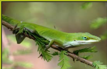
Green anole

Avoid electric bug zappers, mosquito foggers, and misters - they may inadvertently hurt or kill beneficial insects and other wildlife. Studies have shown "bug zappers" are not effective on mosquitoes.