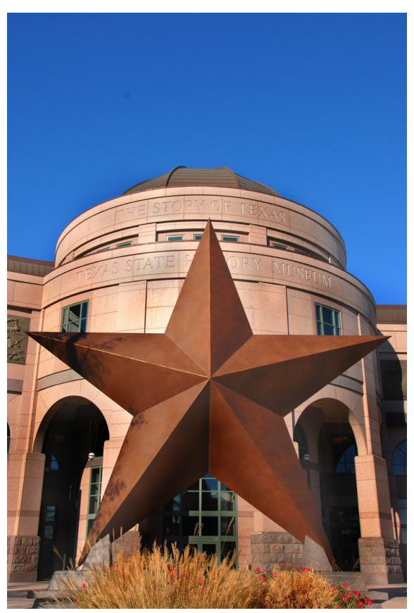
Bob Bullock Museum

When you add or drop a dependent during Open Enrollment, the change is effective January 1, 2013. For changes to be effective immediately, call the Employee Benefits Division at 512-974-3284 within 31 days of the status change to schedule an appointment with a Benefits representative.