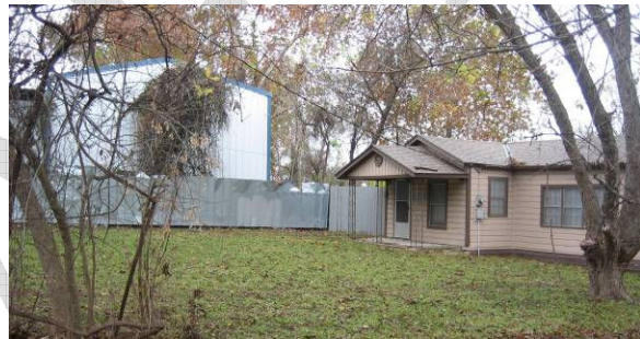
Commercial uses encroach upon a residence on Elliot Street.

While land use planning cannot foresee all eventualities, it can provide the blueprint for a more balanced and livable community for area residents, businesses, and visitors.