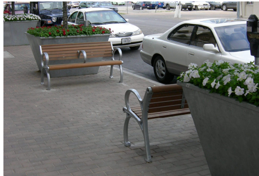
The mixed use developments in San Francisco (left) and along 2 nd Street in downtown Austin (right) have commercial entrances fronting the street and pedestrian pathways protected by trees and planters, respectively.

Although neighborhood stakeholders recommended that North Lamar Boulevard become a mixed use corridor, there was a recognition and concern about the affordability of these future developments. Concerned about affordability in similar developments throughout the City, neighborhood stakeholders wanted a portion of the new residential units of mixed use developments to be as affordable as possible. They felt it important to ensure affordability in these new developments to maintain the NLCNPA's position as a relatively affordable neighborhood within the City of Austin.