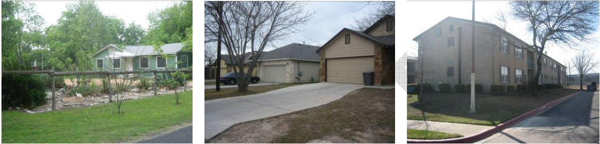
The housing stock of the NLCNPA represents its rural roots and suburban development with (from left) farm-style homes, suburban-style tract homes, and apartment complexes.

stock represents both its rural roots and suburban-like development: rural, farm-style homes, suburban-style tract homes, and large apartment complexes are all components of the housing typology found throughout the NLCNPA. Throughout the planning process, stakeholders identified the sense of place created by the variety of house designs and lot configurations as valued characteristics of their neighborhoods. By preserving the large residential core of the NLCNPA, both the character and identity of these neighborhoods will be maintained.