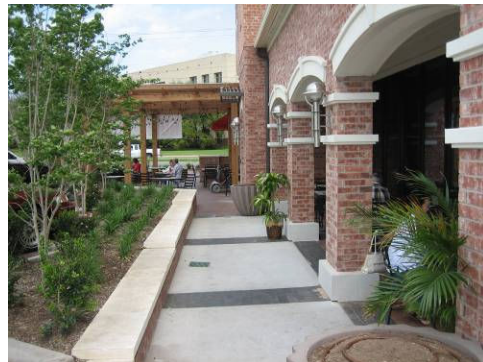
The Triangle, located at the intersection of North Lamar Boulevard and Guadalupe Street, was cited by stakeholders as the example of mixed use development to be used for the redevelopment of the portion of North Lamar Boulevard that runs along the NLCNPA. A good mixture of local-serving restaurants and stores (right) are built beneath residential units in the Triangle development.

In response to the largely commercial nature along North Lamar Boulevard, neighborhood stakeholders wanted to change its current character by making it a