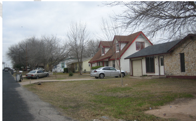
Turner Drive, in Mockingbird Hill, contains a good mixture of single-family houses.

The single-family character of the NLCNPA is influenced by an interesting patchwork of architectural styles. In Mockingbird Hill, a neighborhood in the northern part of the NLCNPA, houses built in the 1930s share the streets with those built between the 1950s and the 2000s. This area is noticeably different from the residential subdivisions immediately to the south. The houses here were built during the 1970s and 1980s and have characteristics reminiscent of those decades. Similar patterns continue south of Rundberg Lane. The area bounded by Rundberg Lane, I-35, Little Walnut Creek, and Georgian Drive has a more markedly rural feel than the rest of the Georgian Acres neighborhood and is characterized by larger lot sizes. To the west, 1960s suburban-style development is prevalent in the residential area between North Lamar Boulevard and Georgian Drive. Many of the houses in the area between Little Walnut Creek and Oertli Lane were built in the 1950s or before. South of Oertli Lane, the housing reflects 1950s and 1960s suburban house design; houses along Red Oak Circle and White Oak Drive reflect popular styles of those decades. Regardless of the decade in which they were built, the majority of the houses throughout the NLCNPA are modest in size and ornamentation.