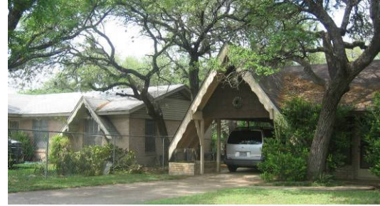
Houses on Red Oak Circle reflect popular architectural styles of the 1950s and 1960s with their front gables and ornamental, wooden tile siding.

In the planning process, stakeholders noted the need to provide housing options for current and future residents of the NLCNPA. To maintain a balanced residential character, housing options (both owner-occupied and rental units) must be readily available. However, when compared to other planning areas, the NLCNPA contains a disproportionate amount of rental units and large apartment complexes. Of the total number of residential units in the planning area, 80 percent are rental and nearly 69 percent of all housing units within the NLCNPA are in multifamily developments (Table L) 22 . Stakeholders thought further development of such complexes should be restricted throughout the neighborhood: they believed a more balanced mix of housing options and homeownership opportunities will stabilize the area.