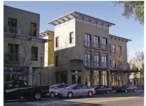
Small scale hospitality or residential buildings.