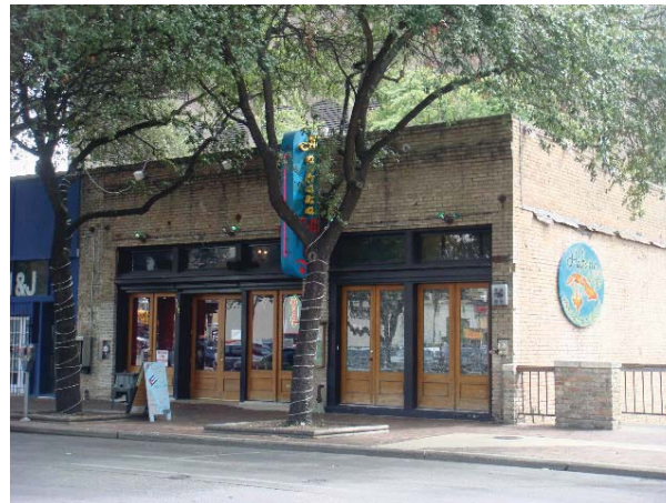
Restaurants add to the vitality of public life.