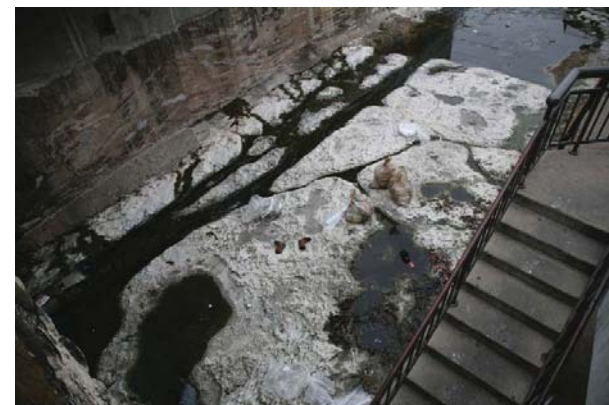
Clean-ups are held twice a year and are sponsored by UT Environmental Health and Safety and the Texas Natural Science Center