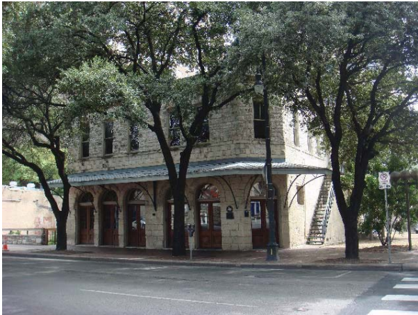
Historic buildings offer new opportunities.