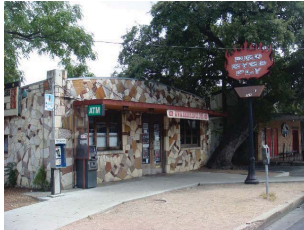
Build on the character of unique businesses.