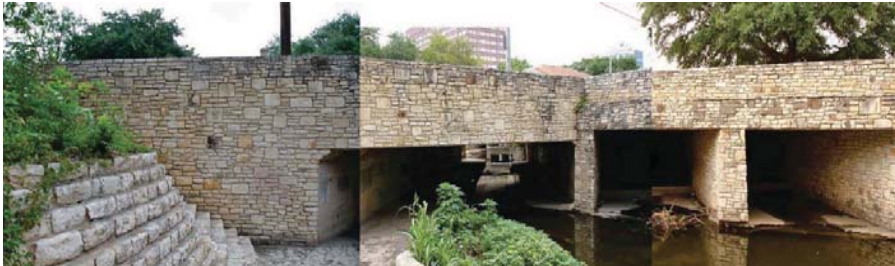
Looking East to Red River Bridge