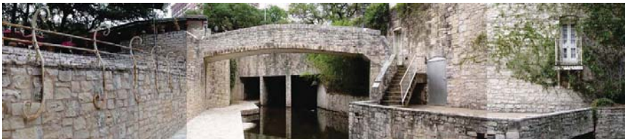
Looking South to 11th Street Bridge