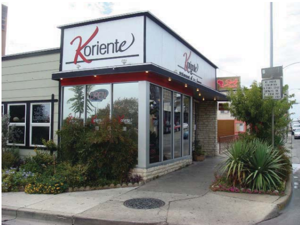
Creative businesses and small enterprises.