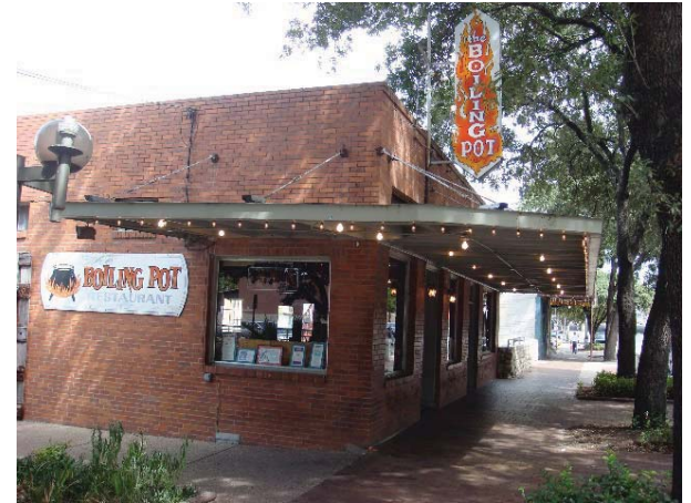
Businesses that cater to daytime activities.