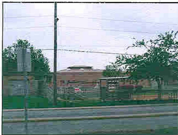
Front Parking Lot Facing Murchison Middle School