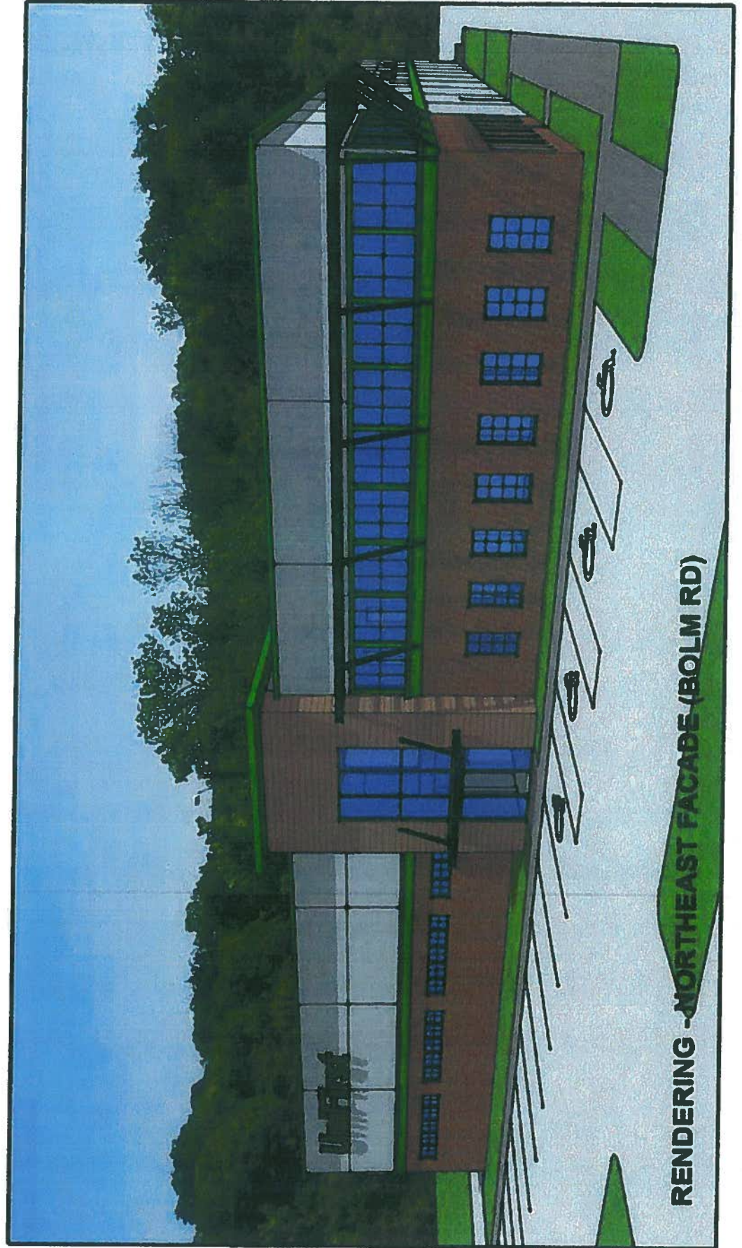
RENDERING - NORTHEAST FACADE (BOLM RD)